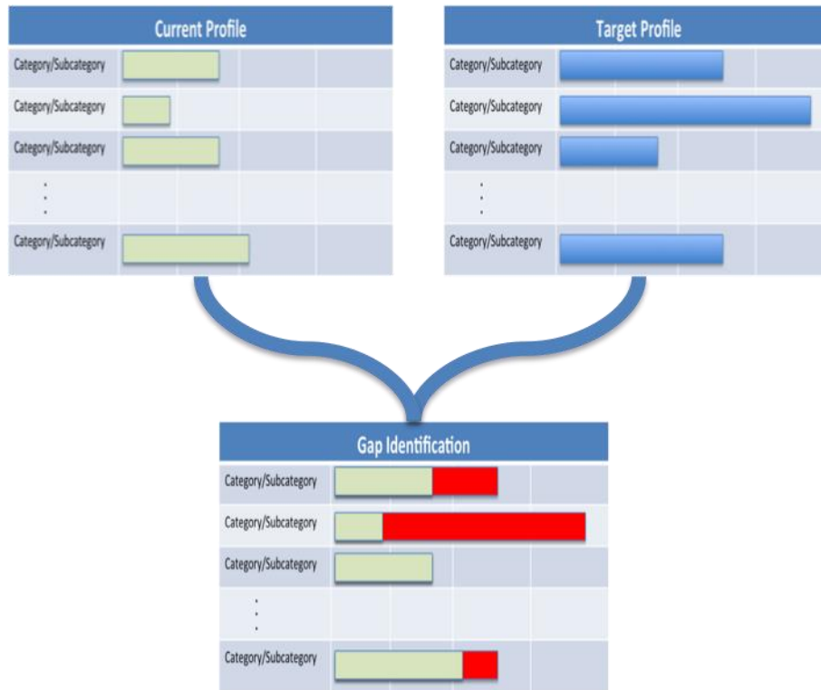
300 301 Figure 2: Profile Comparisons