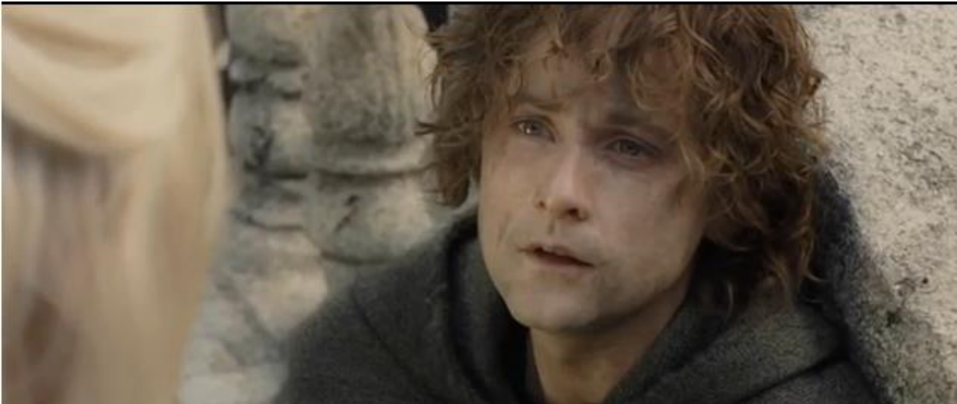
Lord of the Rings: Return of the King