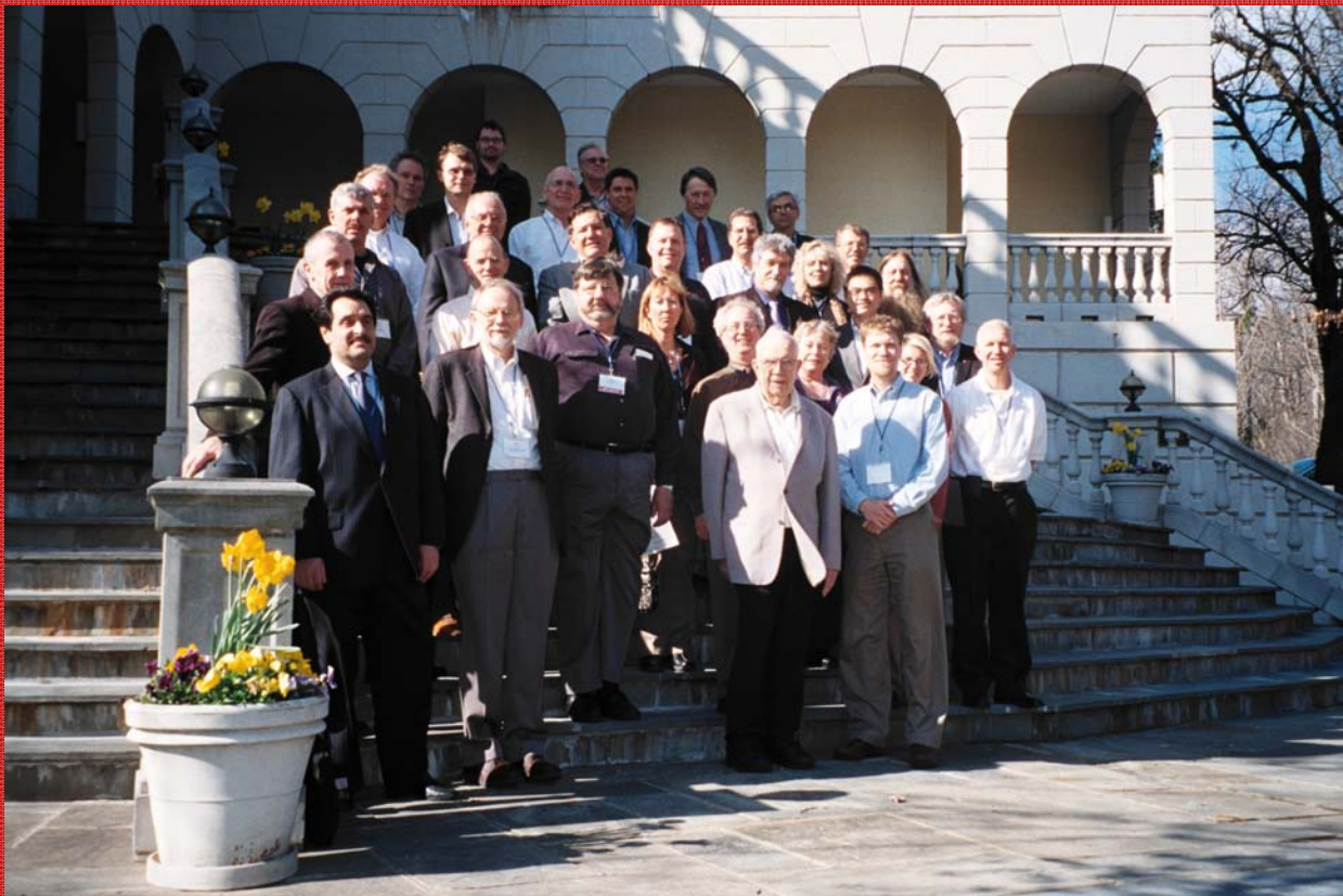
FIGURE 3: 2008 RETHINKING EGRESS WORKSHOP PARTICIPANTS

Averill then thanked the participants and NIBS staff and declared the Rethinking Egress workshop adjourned.