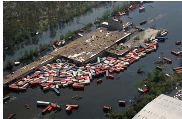
Figure 6-6: Shipping containers are displaced by high winds and storm surge.

A unique vulnerability of maritime infrastructure is associated with sea level rise (SLR). Globally, the sea level is expected to rise by 7 to 23 inches by 2099. When combined with high tides and storm surges, this is the most probable threat to port infrastructure. Resulting changes in sediment movement lead to siltation along channel entrances, affecting accessibility for some ships. The risk of corrosion increases as more surface area comes in contact with the water. Some susceptibility to scour and flooding is ever present and is exacerbated by SLR, though it is usually accounted for in port design. This climate change impact has the potential to exact disaster-like tolls from the maritime infrastructure (Wakeman 2013).