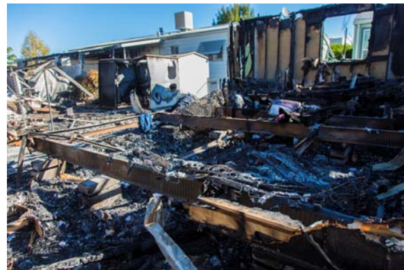
Figure 6-8: Fire damage from broken gas lines

The DOT’s Pipeline and Hazardous Materials Safety Administration have identified five areas for local governments to develop mitigation strategies to improve protection of pipelines and increase the resiliency of the transmission system: 1) pipeline awareness (education and outreach); 2) pipeline mapping; 3) excavation damage prevention; 4) land use and development planning near transmission pipelines; and 5) emergency response to pipeline emergencies (DOT 2013, 3). Identifying pipeline locations and entering the information into the National Pipeline Mapping System is a key first step toward resiliency. Knowing where pipelines are located and making that information available is important to comprehensive planning, hazard mitigation planning, and preparedness, response, and recovery activities. Redesign or realignment of pipes to avoid liquefaction zones, faults, areas of subsidence and floodplains is only possible if a the location of both the pipeline alignment and the hazards are known and mapped. Similarly, local government can create a buffer zone around pipelines to increase the right-of-way to provide an extra