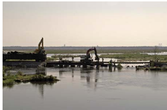
Figure 6-4: A railroad bridge in New Orleans is washed out by flooding.

Since rail systems tend to be less interconnected than roadway systems, more key points serve as bottlenecks to different areas that could be severely affected by a disaster (Lazo 2013). One example is the failing Virginia Avenue tunnel in Washington D.C., through which 20 to 30 cargo trains travel each day. The tunnel, now 110 years old and facing structural issues that would cost $200 million to repair, has a single rail line, forcing many freight trains to wait while others pass through. Bottlenecks like this cost the US about $200 billion annually, 1.6% of GDP, and are projected to cost more without adding capacity along nationally significant corridors (ASCE 2013). Any disruption to these points in the system could cause significant economic disruptions, indicating a need to build in alternate routes and, thus, redundancy into the system.