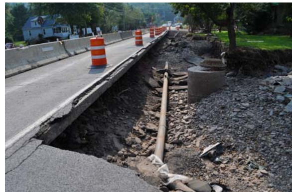
Figure 6-1: Road undercutting in the aftermath of Hurricane Irene.

In addition to moving people and goods on roads and highways, essential utilities distribute services either along-side, above, or below the grade of roads. Therefore, when roads and highways fail, it not only disrupts the ability to move people and goods – it can leave the necessary utility services vulnerable to both the initial and possible secondary hazards (e.g., a tree or other debris falling on an exposed gas or water pipe). For example, flooding can result in undercutting roads. In Figure 6-1, a pipe (an example of an interdependency) that lies directly underneath the road was also vulnerable to damage as a result of road failure.