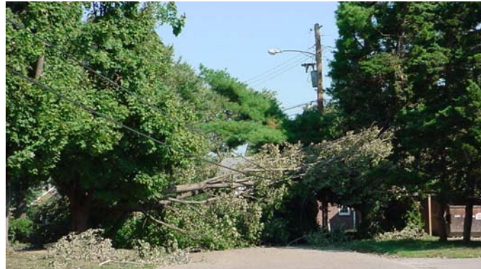
Figure 6-2. Local Road Blocked by Fallen Trees after Remnants of Extra-tropical Storm Struck Kentucky (Kentucky Public Service Commission 2009)

Failure or loss of service of individual roads does not typically cause a major disruption for a community because redundancy is built into the road network (i.e., alternate routes can be used). Major disruptions occur when a significant portion or critical component of the road/highway network fails such that people and goods cannot get to their destination. Large areas of the road/highway system can be impacted by debris from high wind events (hurricanes, extra-tropical storms, tornadoes), flooding as was seen in Hurricane Sandy, earthquakes, and ice storms. In the short term, tree fall (see Figure 6-2) on roads slows-down emergency response and repair crews from getting to locations where their assistance is needed.