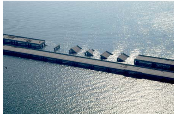
Figure 6-3: Bridge sections slid off their moorings during Hurricane Katrina due to wave action.

Longer bridges tend to have relatively lightweight superstructures (decks and girders) so they can span long distances. Historically, their relatively low natural frequencies have made some of these bridges susceptible to high winds because their low natural frequencies could be matched by the high winds. Thus resonance of the bridge could occur, producing large oscillations and failure in some cases. However, modern long span bridges are mostly subjected to aeroelastic wind tunnel testing to understand the dynamics of the structure and make changes in design (e.g., adding dampers or changing aerodynamic properties) to avoid failure during high wind events (FWHA 2011). Moreover, some older long span bridges have been tested and retrofitted to ensure that they are not vulnerable to wind failures.