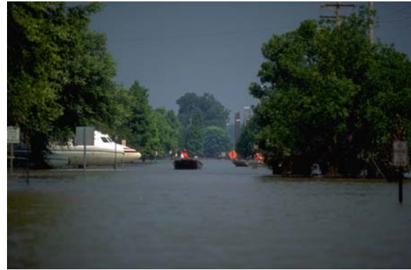
Figure 6-5: Flooding closed the Chester County Airport and moved planes.

As previously discussed, airports play an integral role in moving people and supplies before and after a disaster. Any major disaster will include increased load from evacuation. Additionally, if some airports in an area close, other airports must deal with redirected flights and increased loads (ACRP 2012). After a disaster, federal and state aid is most quickly administered by air. These factors mean that airports are most necessary when they are most vulnerable, directly before and after a disaster. Increasing disaster resilience in airports is, therefore, essential to increasing overall community resilience.