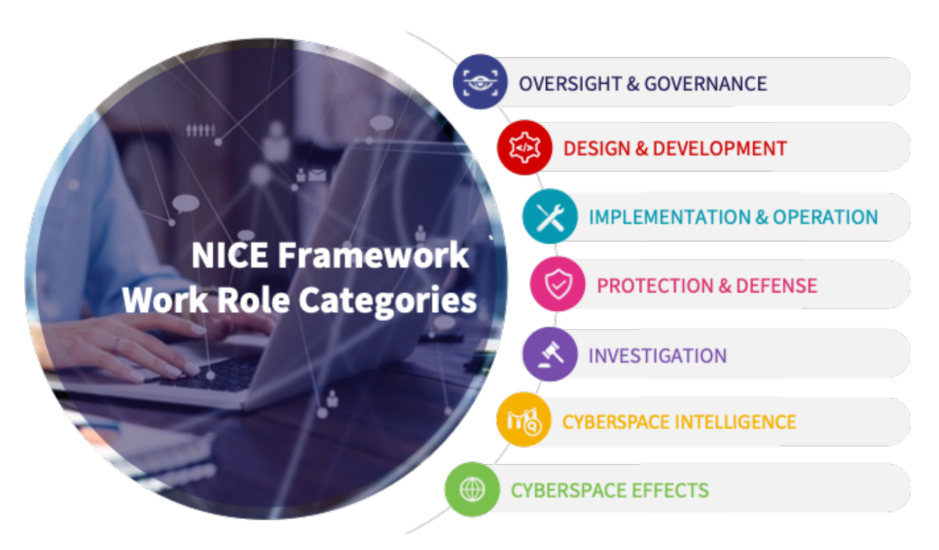
Figure 1: NICE Framework Work Role Categories (v.1.0.0)

TKS statements have undergone thorough reviews and revisions, encompassing several types of changes. The changes described below can each be understood as a combination of retentions,