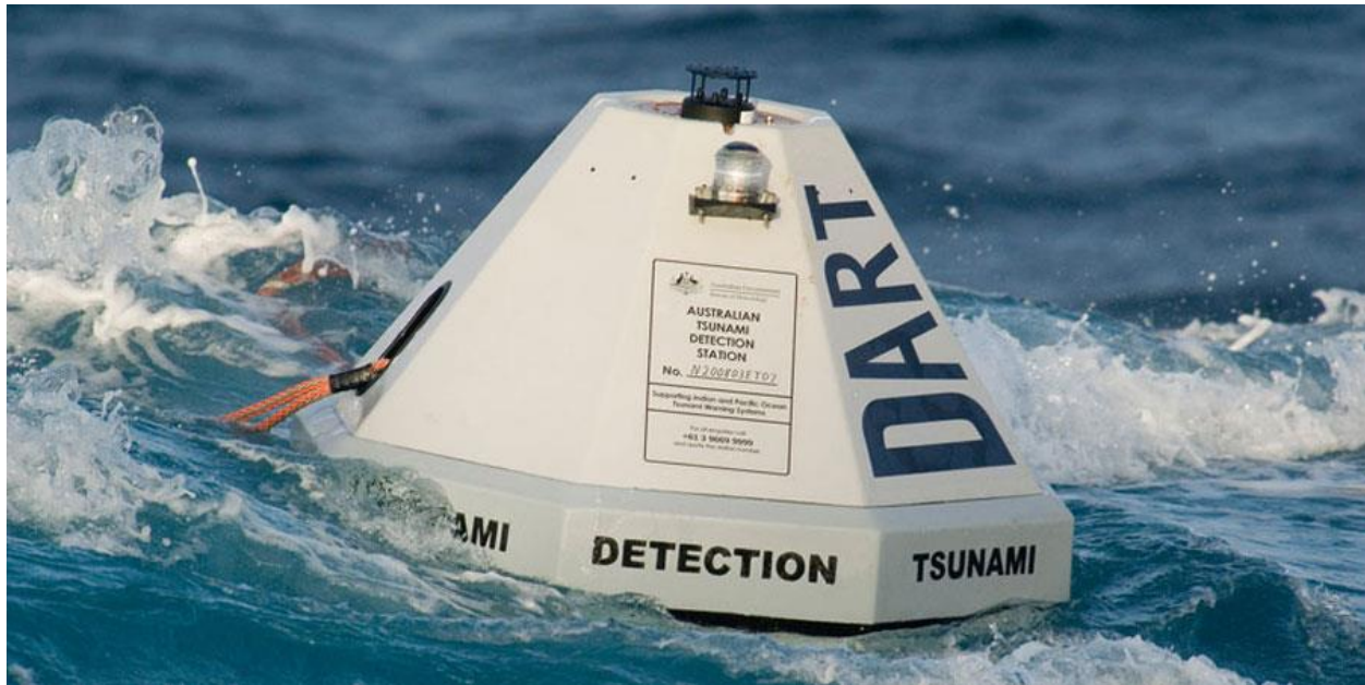
DART buoys detect tsunami waves and transmit real-time sea level information measurements back to the Tsunami Warning Centers.

Meanwhile, half a world away in the Pacific Ocean Basin, the eruption generated ocean waves that rippled around the planet and set off widespread tsunami advisories. The alerts were triggered by a network of Deep-ocean Assessment and Reporting of Tsunamis (DART) buoys, which are positioned strategically throughout the ocean and send real-time data to tsunami warning centers. After the volcanic eruption, DART buoys recorded the propagating tsunami waves and prompted critical tsunami alerts for many coastlines that were later flooded.