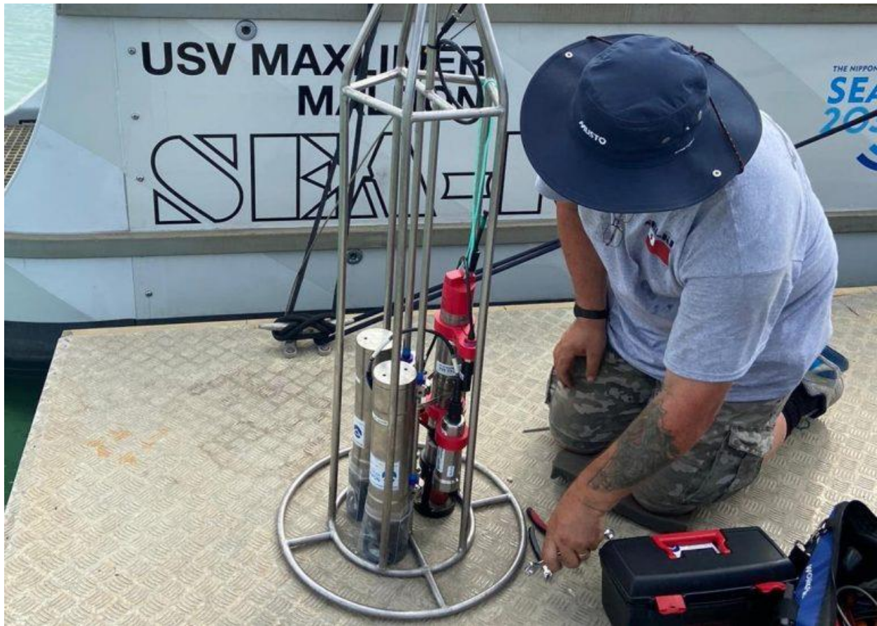
A SeaKit engineer on the dock in Tonga mounting the PMEL MAPRs onto a specifically designed cage to fit on the USV Maxlimer.

As part of the ongoing Tonga Eruption Seabed Mapping Project, a team of scientists conducted a deep-water survey to better understand the impacts of the January 2022 Hunga Tonga-Hunga Ha'apai volcanic eruption on the ocean environment. The research team used a technology developed by NOAA's Pacific Marine Environmental Lab (PMEL) to determine the level of ongoing volcanic and hydrothermal activity within the post-eruption caldera. The Miniature Autonomous Plume Recorder (MAPR) instruments made it possible for scientists to capture direct measurements of the water column up to 300 meters deep. This is the first time that such a survey has been conducted entirely remotely, using an uncrewed surface vessel that was operated and monitored by engineers and scientists located across the globe.