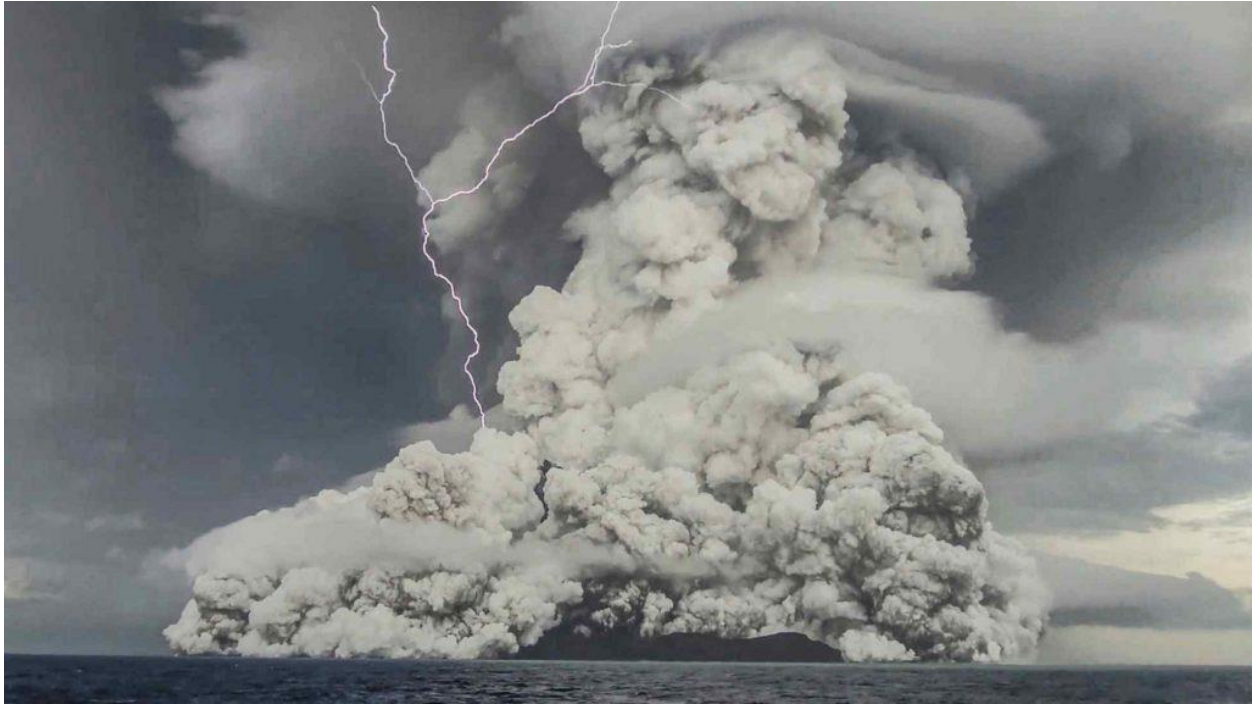
The Hunga Tonga - Hunga Ha'apai volcano erupted on 15 January 2022.

As the sulfur plume traveled westward, researchers from NOAA Chemical Sciences Laboratory, CIRES, and the University of Houston gathered on La Réunion island in the Indian Ocean, about 8,000 miles away from the initial volcanic blast. The plan was to use specially-designed balloons to lift lightweight aerosol sensors high up into the stratosphere, where they could collect air quality data as the plume passed overhead. NOAA's satellites tracked the movement of the volcanic cloud, and the scientific team worked quickly to prepare.