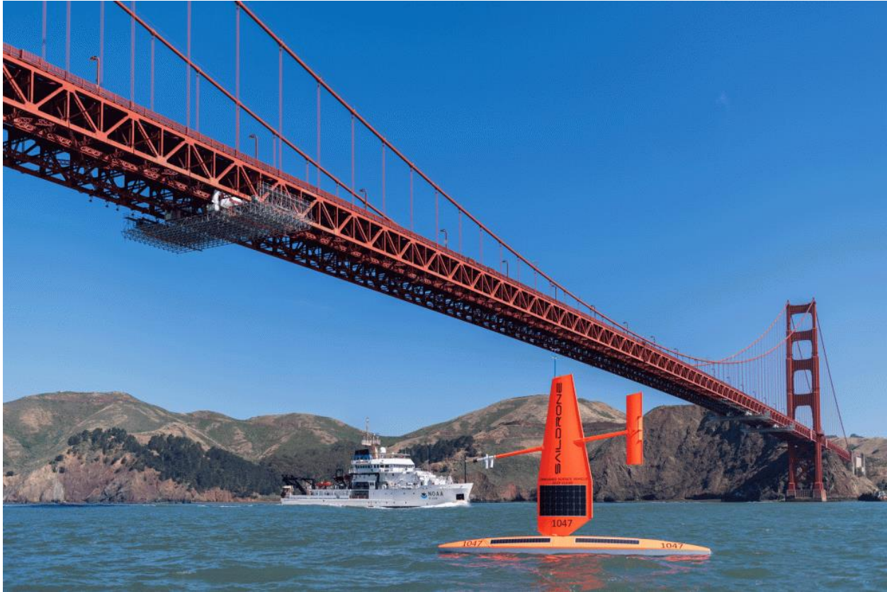
A SAILDRONE collects data beneath the Golden Gate Bridge, alongside a NOAA research vessel.

The SAILDRONES that were deployed in the Pacific Ocean during the volcanic explosion were able to detect jumps in atmospheric pressure and capture crucial information in an observationally-sparse region of the ocean. This data is particularly valuable because only about 5% of tsunamis are generated from volcanic activity, rather than earthquakes. The high-resolution measurements from the drones, coupled with the records from the DART buoys, will help scientists better understand these types of rare events and incorporate volcano-induced tsunamis into the model used to inform hazard response to tsunamis.