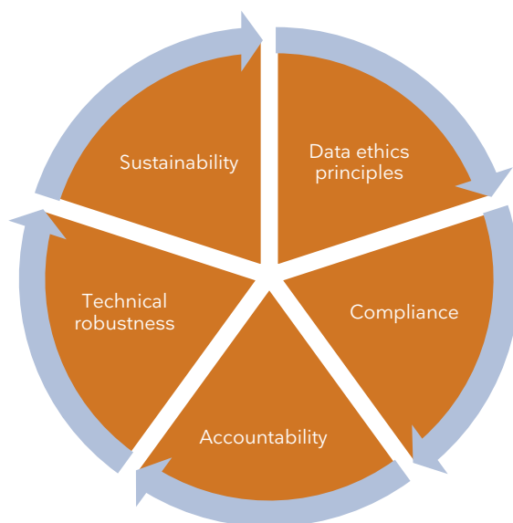
Figure 1 An AI procurement framework

This white paper suggests an AI procurement framework that is based on a set of data ethics principles that are to be applied within the context of legal obligations and demands for accountability, technical robustness and sustainability.