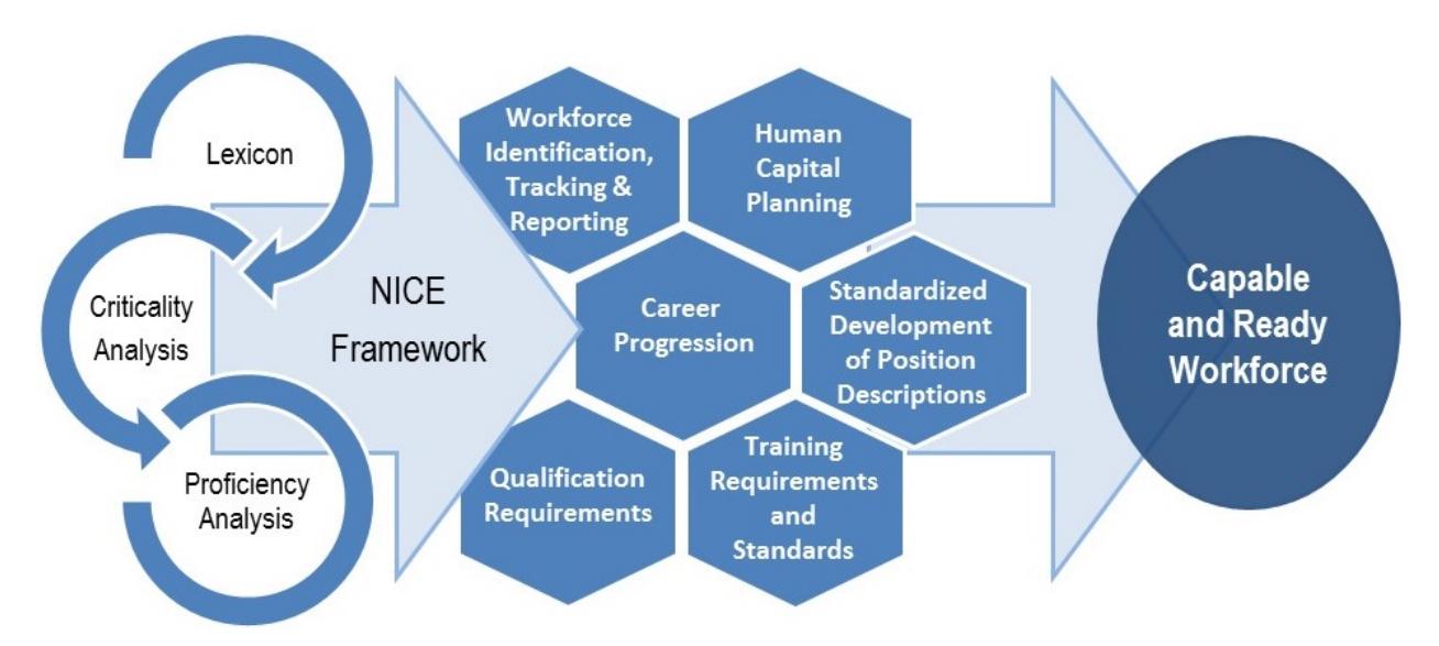
Figure 2 - Building Blocks for a Capable and Ready Cybersecurity Workforce

<u>Figure 2</u> illustrates how the NICE Framework is a central reference to help employers build a capable and ready cybersecurity workforce.