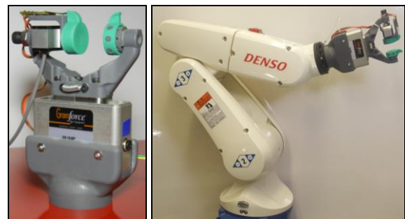
Figure 2. Pneumatic gripper augmented with fingertip skin sensor mounted on an industrial arm from Denso