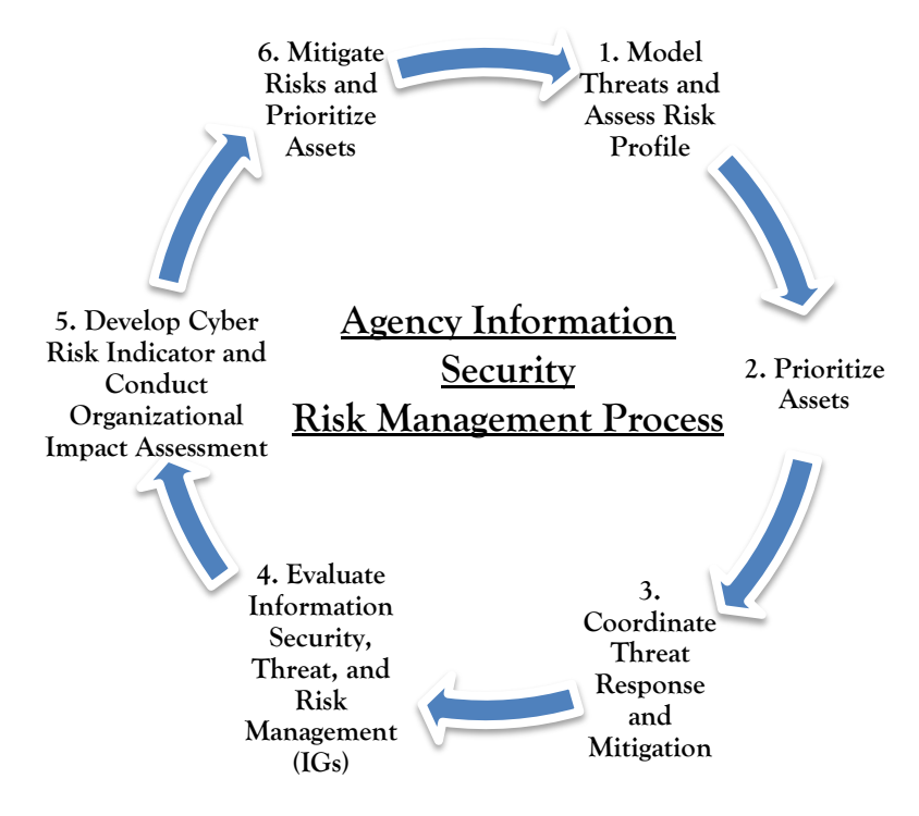
Figure 1. "Agency Information Security Risk Management Process."

The framework draws upon existing processes and new methods of evaluation to produce clear, prioritized results.