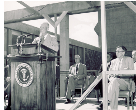
President Eisenhower dedicates NIST's Boulder campus in 1954

World-class work is impeded by obsolete Boulder and Gaithersburg facilities.