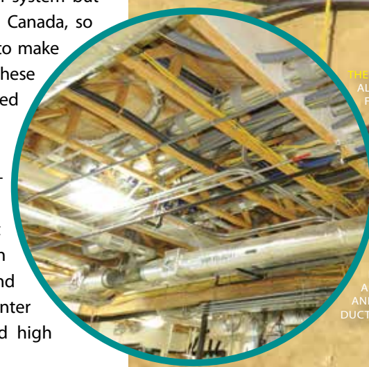
THERE ARE THREE ALTERNATIVES FOR COOLING AND HEATING THE NZERTF: A TRADITIONAL METAL DUCT SYSTEM, A HIGH VELOCITY AIR DISTRIBUTION SYSTEM AND A SYSTEM THAT WILL MOVE REFRIGERANT AROUND THE HOUSE TO AVOID ALL THE HEAT LOSSES AND AIR LOSSES OF DUCTWORK.