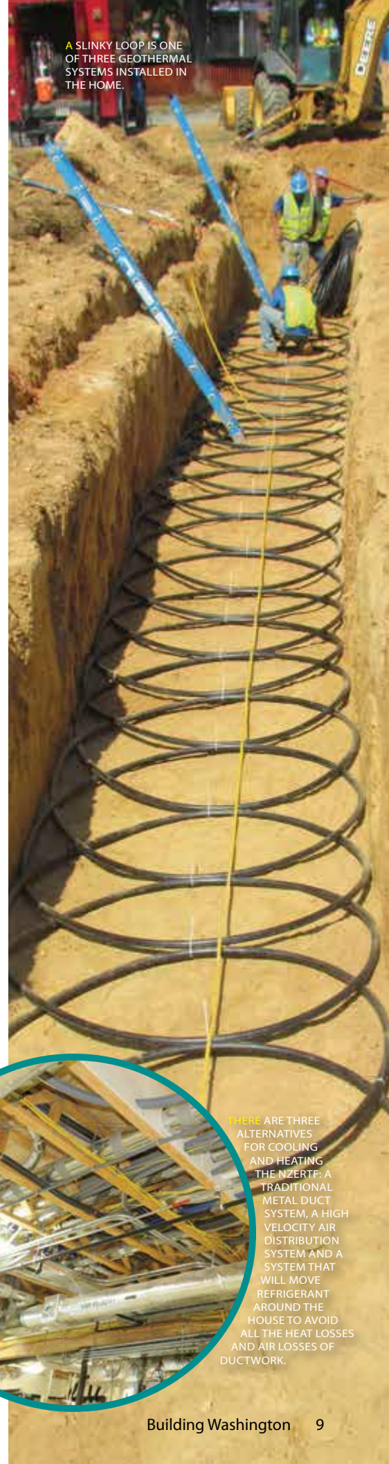
A SLINKY LOOP IS ONE OF THREE GEOTHERMAL SYSTEMS INSTALLED IN THE HOME.