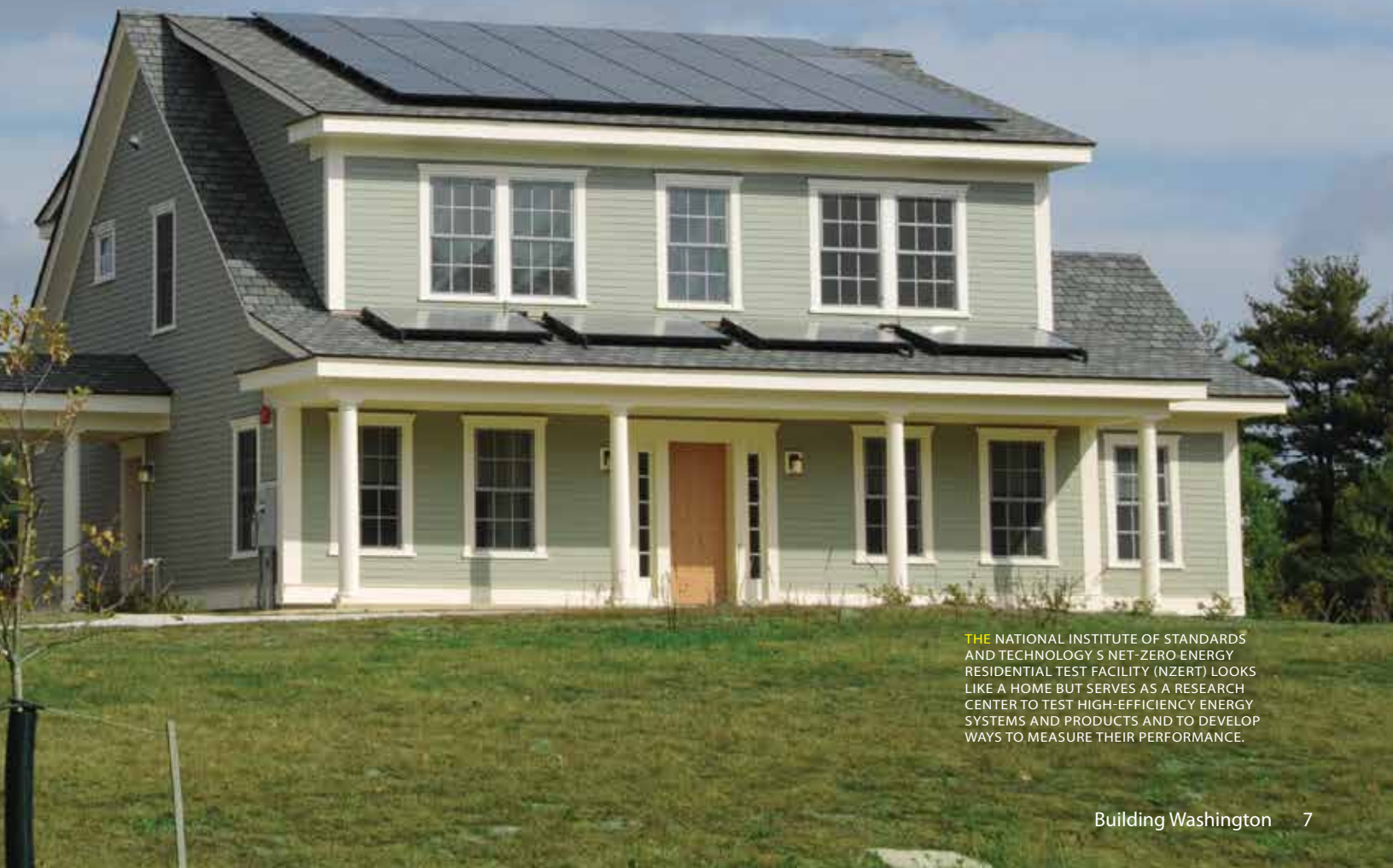
THE NATIONAL INSTITUTE OF STANDARDS AND TECHNOLOGY'S NET-ZERO ENERGY RESIDENTIAL TEST FACILITY (NZERTF) LOOKS LIKE A HOME BUT SERVES AS A RESEARCH CENTER TO TEST HIGH-EFFICIENCY ENERGY SYSTEMS AND PRODUCTS AND TO DEVELOP WAYS TO MEASURE THEIR PERFORMANCE.