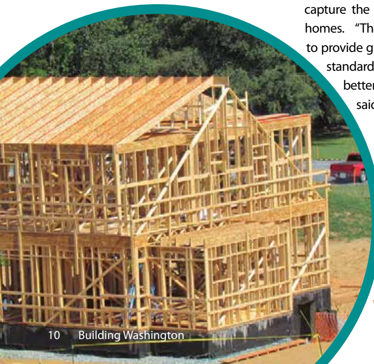
WITH FRAMING ALMOST COMPLETE, THE NZERT LOOKS LIKE A TYPICAL SUBURBAN HOME.