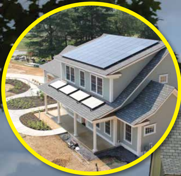
THESE SOLAR PANEL INSTALLATIONS HEAT THE HOME'S WATER, WHILE A LARGER ARRAY ON AN UPPER ROOF HELPS GENERATE ENERGY.