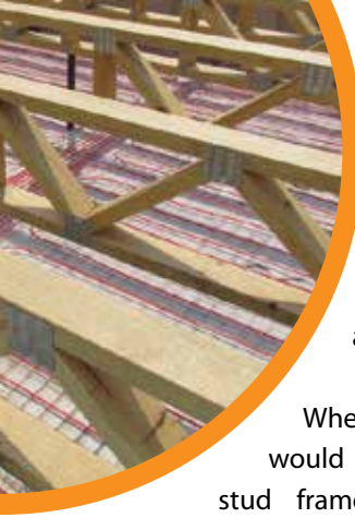
THE ORANGE SLAB-ON-GRADE TUBING IS PART OF THE RADIANT FLOOR HEAT TUBING LOOP THAT WAS EMBEDDED IN THE CONCRETE FLOOR OF THE BASEMENT. NIST WANTED THE RADIANT BASEMENT FLOOR TO MEASURE THE HEAT/COOLING TRANSFERENCE FROM THE GROUND. THE OPEN WEB FLOOR JOISTS ABOVE THE TUBING WERE SET ON THE TOP OF THE FOUNDATION WALL.

have calculated and verified are actually needed.”