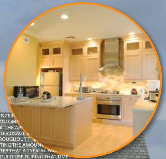
DURING NZER PHASE, AUTOMATED SYSTEMS CONTROL THE APPLICATION OF ENERGY AND WATER USAGE IN THE HOME AND THROUGHOUT THE NEIGHBORHOOD, REPLICATING THE AMOUNT OF ENERGY AND WATER THAT A TYPICAL FAMILY OF FOUR WOULD USE DURING THAT TIME.