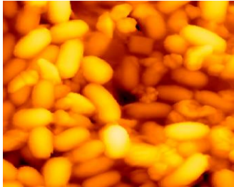
Figure 3.1 Surface-associated spores captured by Atomic Force Microscopy

Microorganisms found in indoor environments most often arise from human sources (continuously shed with human skin and hair) or by transport from the outdoors and once inside can settle on surfaces. Surface-associated organisms can also be re-aerosolized with human activity and building air movement from ventilation equipment and other airflows. Negative impacts to human health from indoor microbes are related to the ability of the organism to persist on surfaces resulting in potential contact transmission and the ability of the organism to degrade materials in the indoor environment generating toxic metabolic by-products.