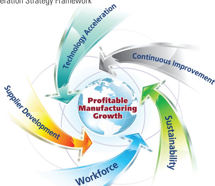
Figure 1: MEP Next Generation Strategy Framework

The plan expands MEP's scope to cover a broader range of services, focused around five service categories, all under the overarching objective of helping companies achieve profitable growth (see Figure 1). The five service categories include Continuous Improvement, Technology Acceleration, Supplier Development, Sustainability, and Workforce.