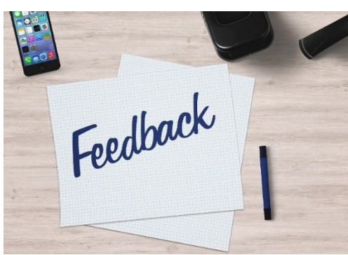
Is your organization using standards on the OSAC Registry? Let us know!

On June 10, 2021 OSAC released a survey to forensic service providers across the country to better understand the current state of OSAC Registry implementation and what support is needed to improve it. The survey is intended to be a yearly snapshot and assessment, and this first one focuses on 46 standards that have posted on the Registry through March 2021.