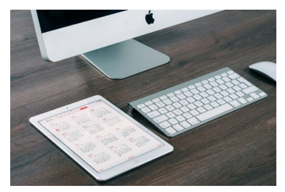
Mark your calendar for these upcoming OSAC

Last day to provide input on CSAFE's Learning 30 Opportunity Survey! Share your feedback on how you and other forensic science events. prefer to consume learning new technologies, research studies and statistics.