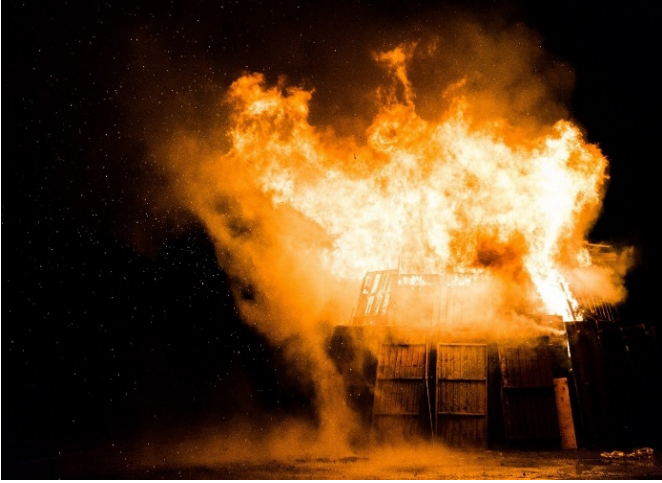
The latest OSAC technical guidance document, Strengthening Fire and Explosion Investigation in the United States: A Strategic Vision for Moving Forward, is available on the OSAC website.

OSAC's Fire & Explosion Investigation Subcommittee has published a technical guidance document, <u>Strengthening Fire and</u> <u>Explosion Investigation in the United States: A</u> <u>Strategic Vision for Moving Forward</u>, that describes recommendations for improving the practice of fire investigation.