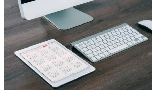
Mark your calendar for these OSAC and other forensic science events