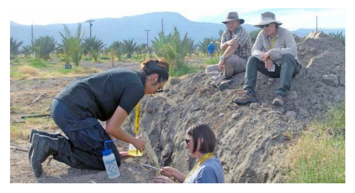
Fig. 10. The Geological Materials Subcommittee held a workshop on the Identification, Collection and Preservation of Soil Evidence at Crime Scenes to assess the suitability of the approach.