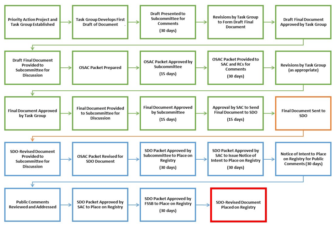
Fig. 9. The Toxicology Subcommittee developed a roadmap of the various OSAC process steps, and made the roadmap available for use by other committees.

In Fall 2016, the Geological Materials Subcommittee held a workshop on the Identification, Collection and Preservation of Soil Evidence at Crime Scenes. The workshop was held during the Joint California Association of Criminalistics (CAC)/The American Society of Trace Evidence Examiners meeting in Palm Springs, CA. The goal of the workshop was to determine whether a document that OSAC was working on was fit for its intended purpose.