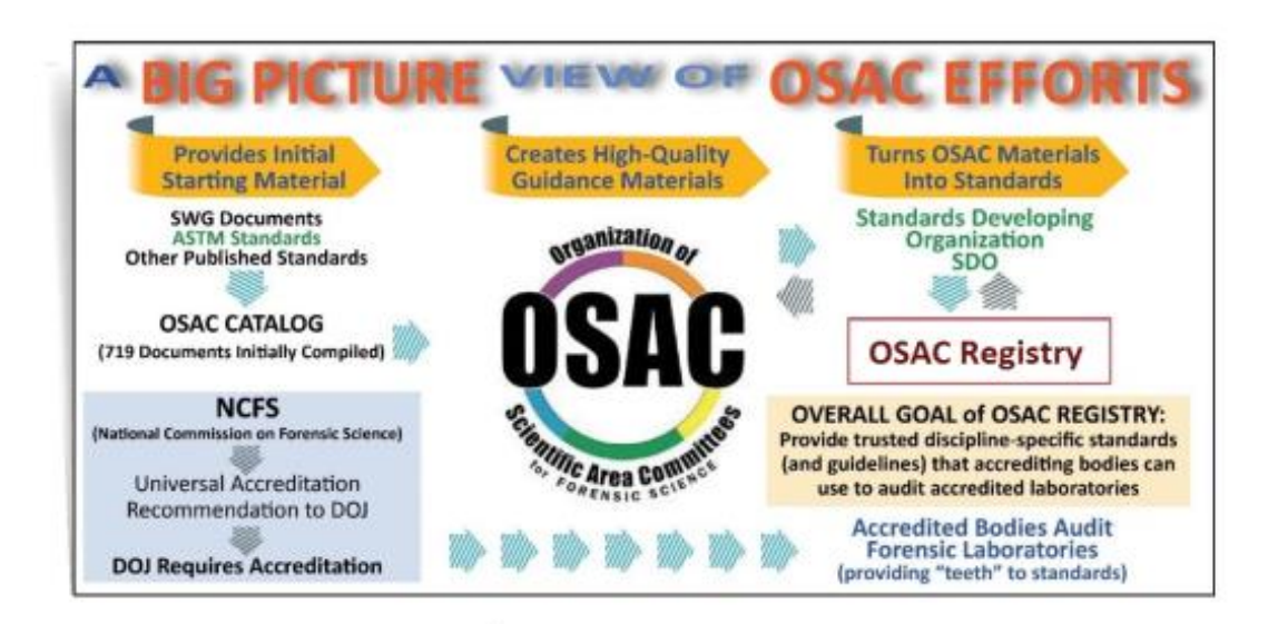
Fig. 5. Big Picture View of OSAC Efforts. OSAC is one entity within a community working towards improved forensic science standards and guidelines.

OSAC is one entity within a community working towards improved forensic science standards and guidelines. Fig. 5 and sections 2.1-2.3 describe how the OSAC program interacts with SDOs and other entities.