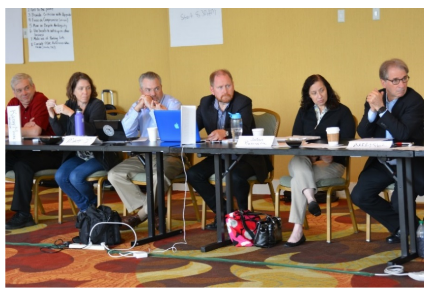
Fig. 4. Biology/DNA SAC, Physics/Pattern SAC, and LRC Representatives at the OLSS Meeting.

Most notably, the FSSB held the OSAC Leadership Strategy Session (OLSS) on June 22, 2016, to share current program perspectives from each of the OSAC committees, collaborate on how to proceed in cases where perspectives may vary, and strive to reach a shared vision of success. The FSSB brought together representatives from all five SACs, three resource committees, statisticians and measurement scientists. The meeting resulted in 25 programmatic recommendations, many of which were implemented in the reporting year. These meetings will be routine and in the future will include subcommittee chairs.