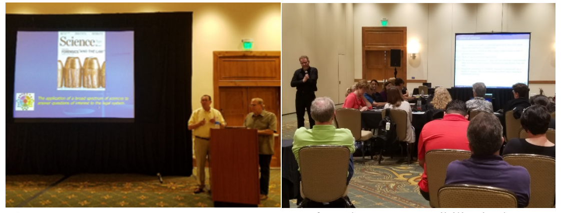
Fig. 7. OSAC Interdisciplinary Discussions. Left: Judge's Responsibility in the Courtroom Briefing at the Summer 2016 Meetings. Right: OSAC Members and Affiliates offer the task group's statistical insights.