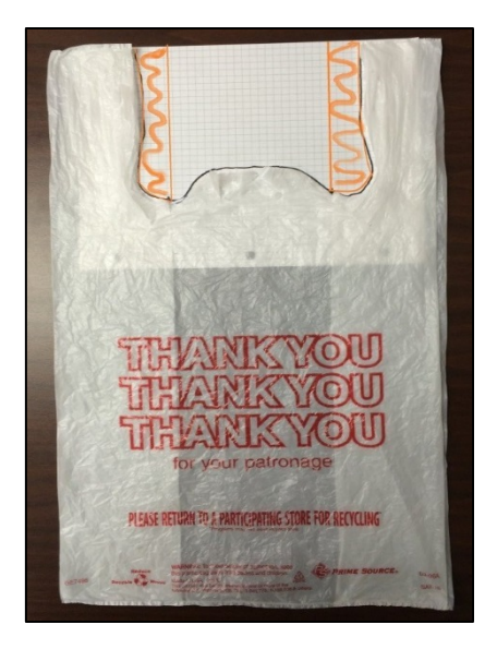
Figure 4-1. T-Shirt Bag.