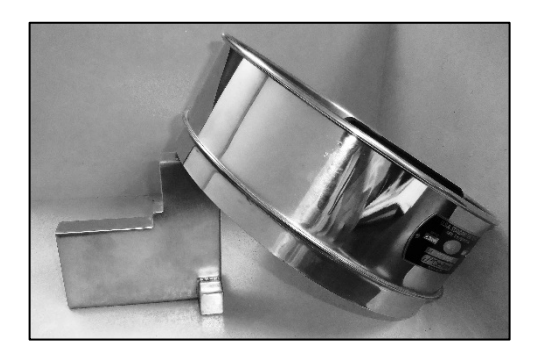
Figure 2-3. Sieve with Tilt Block Set at 30 Degrees.

Method B: Place a sieve on its drain pan. Pour the chitterlings into the sieve and distribute them over the surface of the sieve with a minimum of handling. Hold the sieve firmly and incline it 30 degrees to facilitate drainage, then start the stop watch and drain for exactly two minutes. At the end of the drain time, immediately transfer the drain pan with the purged liquid to the scale for weighing. Dry the empty package to determine its tare weight and enter it in Column C. Determine the purged net weight of the chitterlings using the following formula and record in Column F of the worksheet.