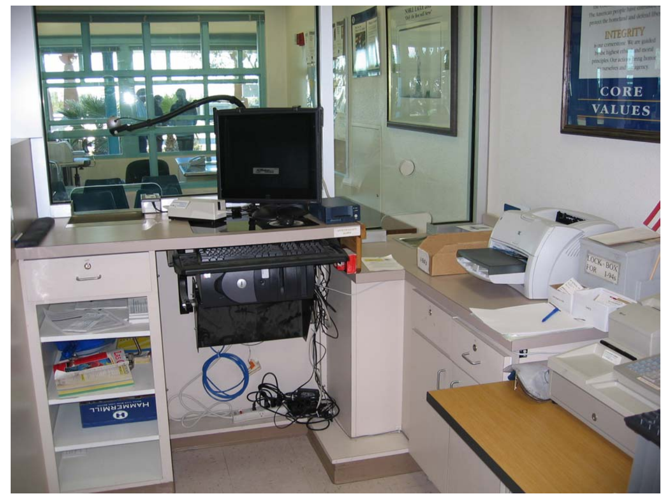
Figure 2: Inspections View – Workstation – Handicap accessible counter made available