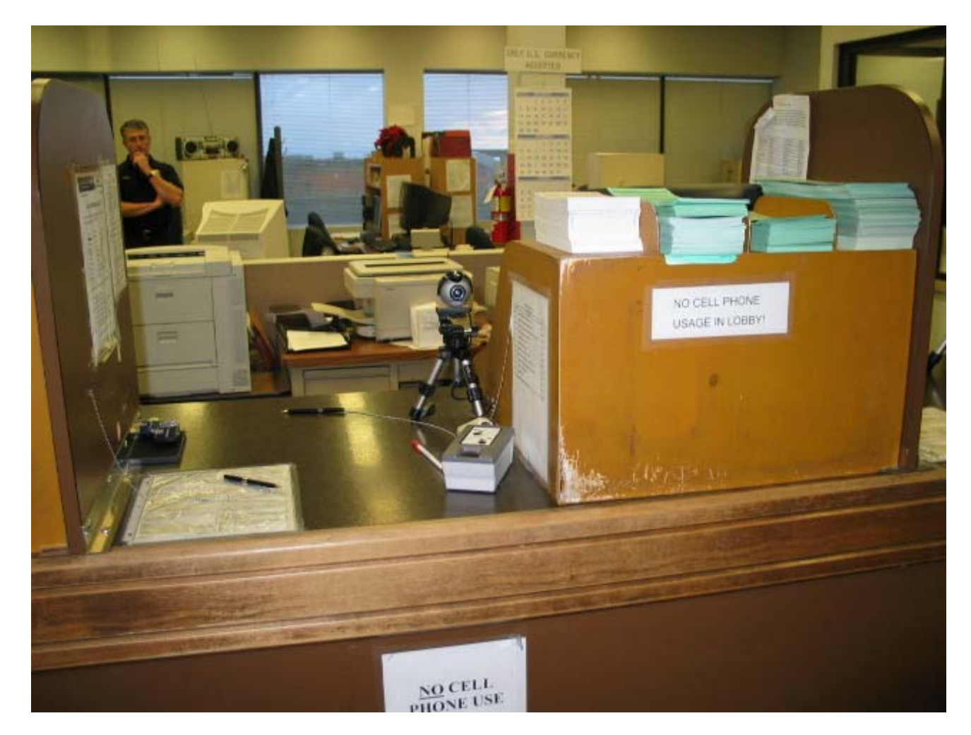
Figure 1: Travelers View – Workstation (Typical)