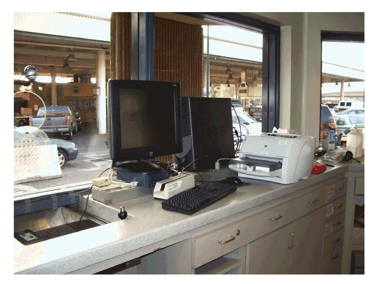
Figure 1: Inspections View – Workstation (Typical) NOTE: Tray to pass fingerprint scanner and glass