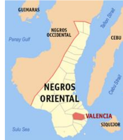
Palinpinon Geothermal Power Plant