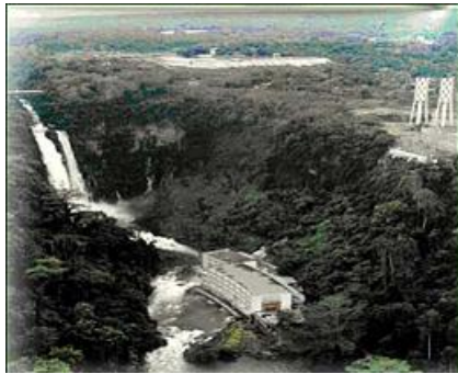
Agus Hydro Power Plant in Iligan City