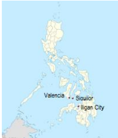
Map of the Philippines