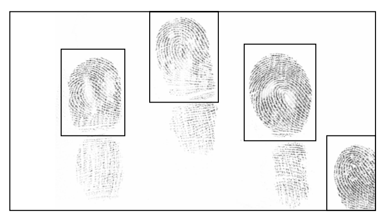
Figure 6. Sample Ground Truth Boxes.