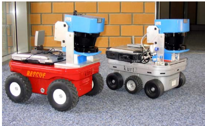
Fig. 1. KURT3D outdoor edition (left) and indoor edition (right).

KURT3D (Fig. 1) is a mobile robot platform with a size of 45 cm (length) x 33 cm (width) x 26 cm (height) and a weight of 15.6 kg (including batteries and laptop). Equipped with the 3D laser range finder the height increases to 47 cm and the weight to 22.6 kg.