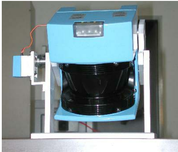
Fig. 4. The AIS 3D laser scanner, as based on a SICK LMS [1].

As remarked in the previous section, the main sensor for navigation and localization is the AIS 3D laser scanner, which we have been using for some time now [1]. It executes a controlled pitch motion between the regular horizontal scans taken by the basic 2D laser scanner. The maximal pitch angle is 120 deg, with possible vertical resolutions of 128 or 256 lines. Together with the selectable resolutions of 181, 361, or 721 points per line over 180 deg horizontally given by the 2D scanner, a variety of selectable resolutions is offered. Depending on this resolution, a scan over the full scan area takes between 3.4 s and about 30 s. The measurement accuracy of the basic scanner is in the order of 1 cm for every single scan point. No quantitative results are known about the correctness of the angular resolutions (horizontal or vertical) of the scanner. Our quite extensive experience with the scanner, as well as experience from another group who use copies of it for generating 3D models of urban streets, tells that it is qualitatively within the range induced by the other sources of error and noise present in the process, i.e., measurement errors and robot pose estimation errors.