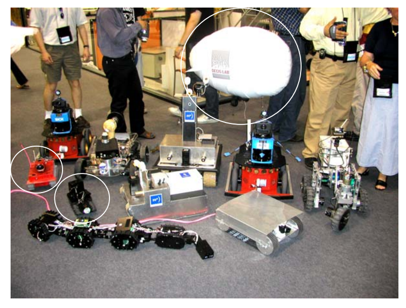
Fig. 1. Some of the robots from RoboCup Rescue 2003, Padua, Italy. (The circled entries are toy vehicles).

"Cost is a formidable barrier between a fire department's desire and ability to purchase an urban search and rescue robot. Using the USF Perceptual Robotics Laboratory as an example, their tethered robots by Inuktun cost US$8,000 to $13,000, and the untethered Urban robots can cost from $33,000 to $40,000.<sup>2</sup>