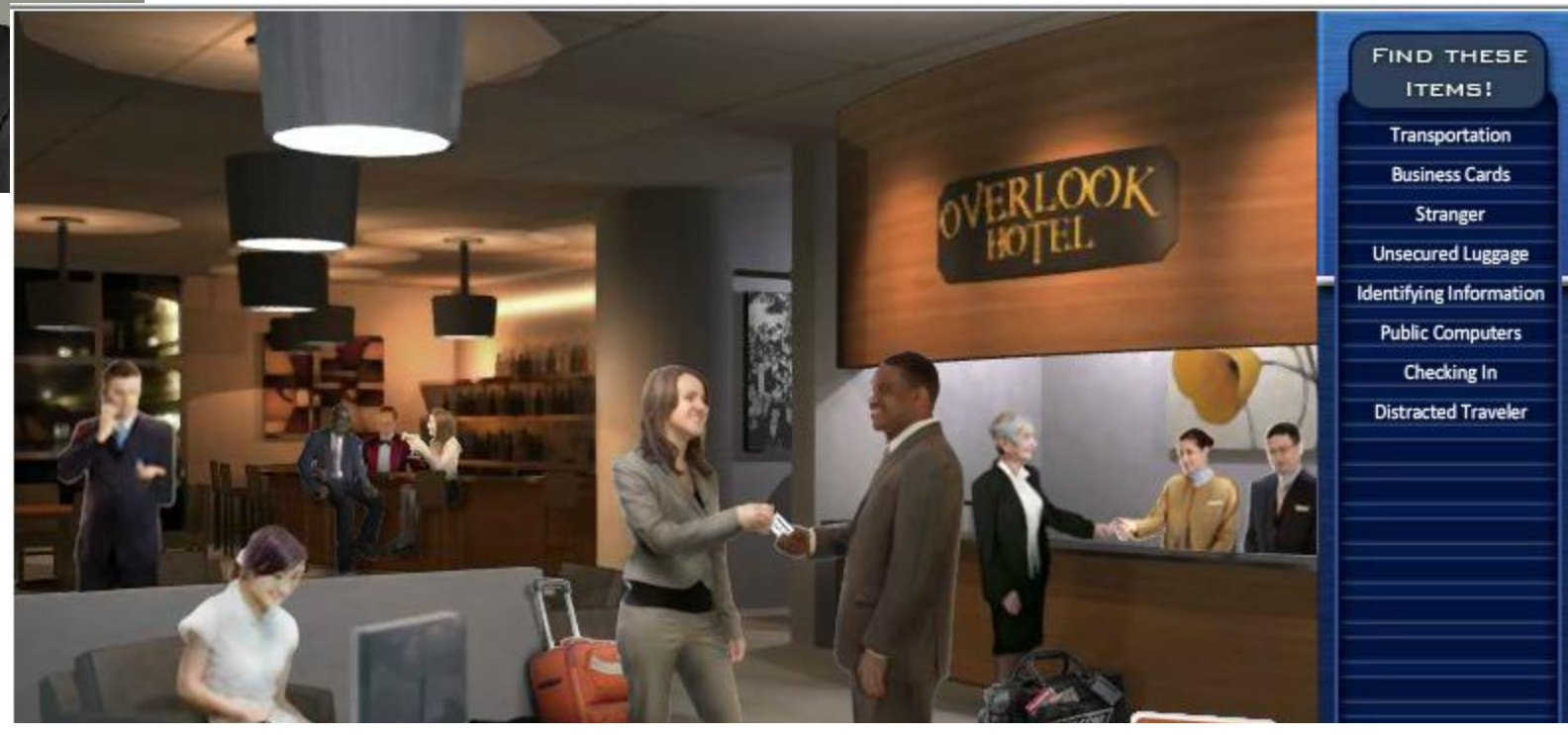
Episode 4: Safe Web Browsing