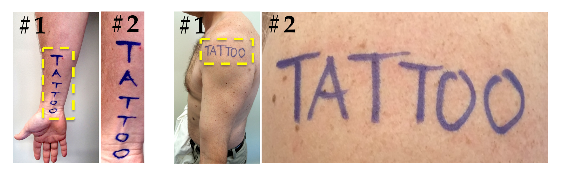
Photo #1: Tattoo is far enough away to show the body location Photo #2: Tattoo is centered and occupies majority of the image