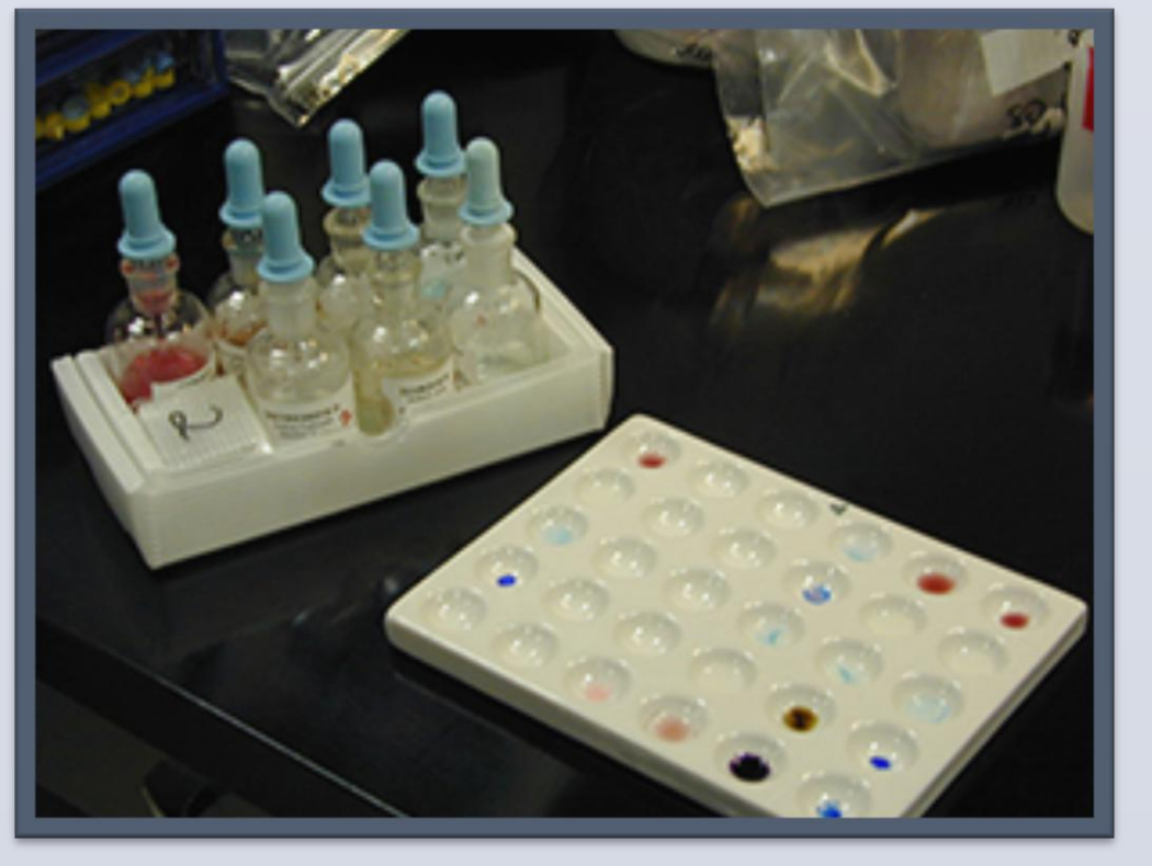
Drug field testing will be utilized for screening