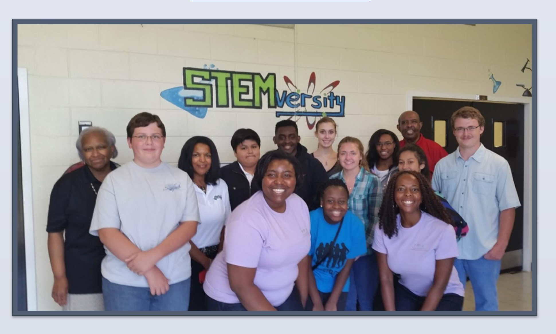
The National Institute of Standards and Technology has supported the Summer Science Academy for the last two years. Starting in the fall of 2016, STEMversity was awarded a three -year grant that will support the FAST Program.

For more information about STEMversity Donate or check out our website at www.stemversity.org