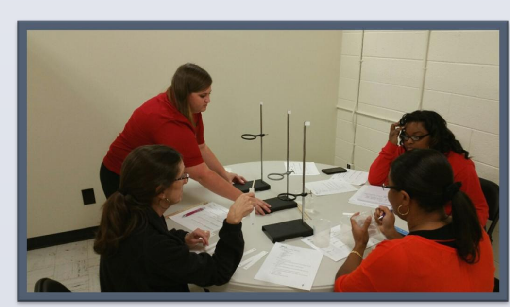
Teachers learn in a laboratory environment