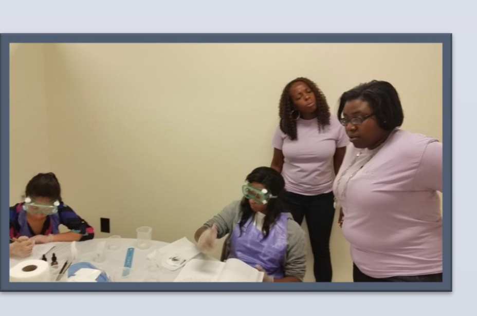
NIST scientists teach DNA techniques to students