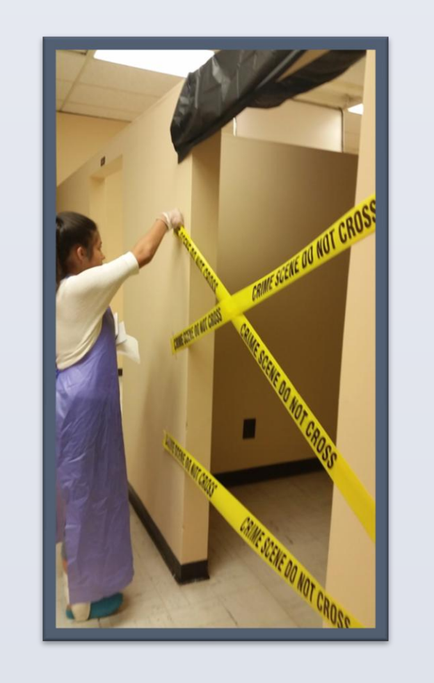
Students conduct Crime Scene Investigations