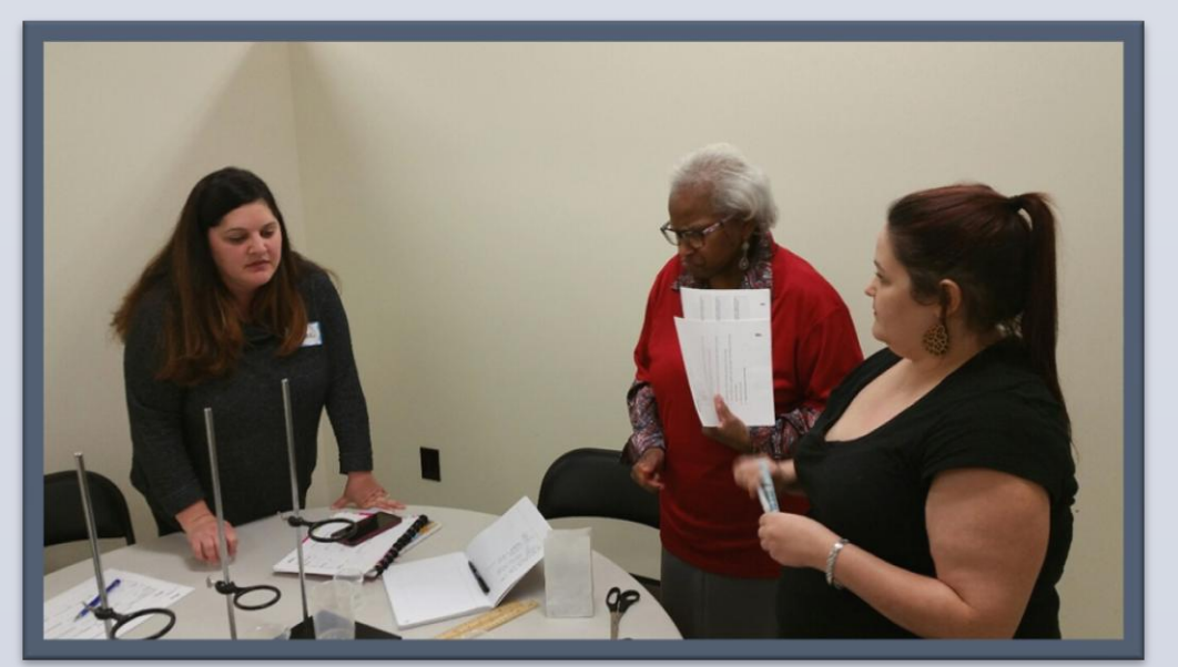
Training includes hands on experiments