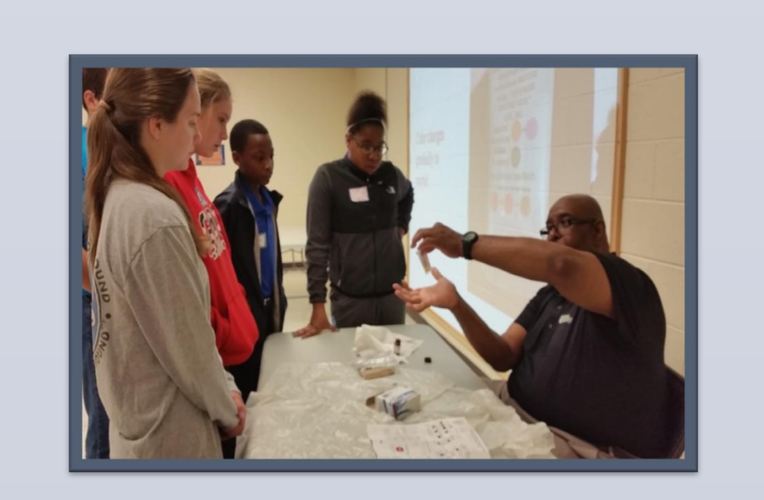
Students learn drug field testing procedures