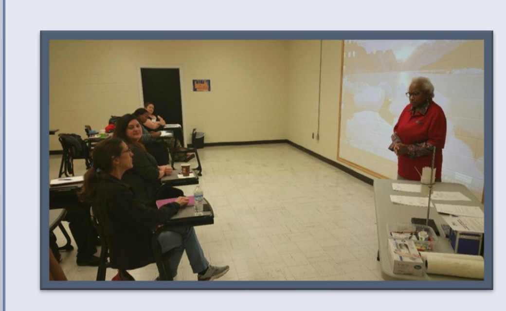
Teachers receive training from experienced Forensic Scientist

Educators use this knowledge to deliver a more robust science curriculum to their students. The STWs are designed for teachers who do not have a science education degree.