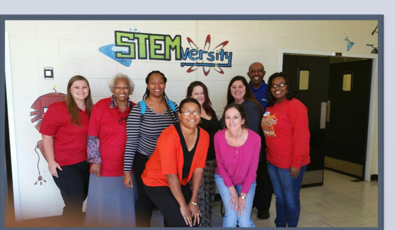
Teachers collaborate and share ideas