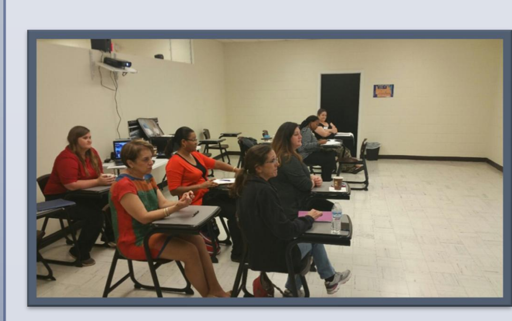
Teachers share best practices