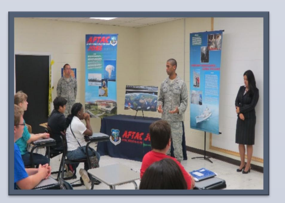
Students learn how forensics is used on the job.