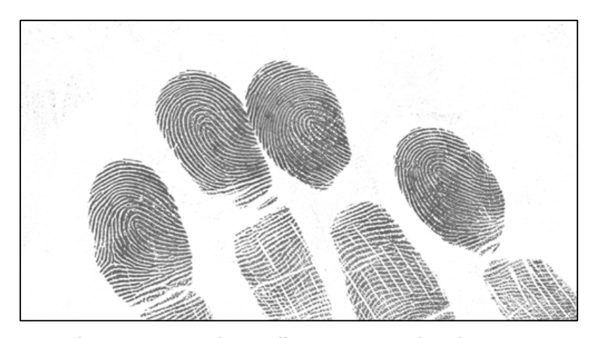
Figure 1. Middle fingers touching in slap.

Slap segmentation can prove difficult due to a variety of scenarios. The most common challenge scenarios include fingerprints that are not clearly separated in an image, a fingerprint which appears as multiple images in a slap, background noise, the "halo" effect, and rotation. Many of these problems are the same as those that existed in the SlapSeg04 evaluation but the use of newer 3 inch platen capture devices can reduce problems such as finger spacing and rotation.