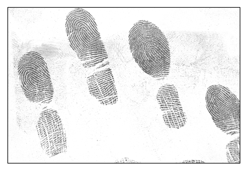
Figure 3. "Noisy" slap image.

Background noise such as extraneous print lines, printed letters, smudges, etc near the boundary of the slap print pose an additional challenge for segmentation. (See Figure 3.) "Noise", which may also be caused by dirt on the platen surface of the scanner, is most problematic in low contrast images.