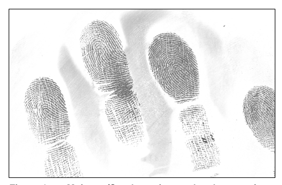
Figure 4. Moisture/Condensation on the platen surface.

The "Halo" affect can make segmentation difficult as it introduces noise to the image. (See Figure 4.) The "Halo" affect is a moisture build up on platen surface of the scanner due to temperature variations (i.e. a warm hand being placed on a cool scanning surface).