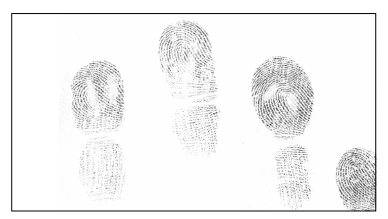
Figure 2. Low Contrast slap image.

At the opposite end of the spectrum, an excessively dry or under inked finger or a fingerprint captured using uneven pressure may be detected as several components due to down sampling or improper thresholding. (See Figure 2). Whether to merge or delete these components depends on the relationship between each sub component and the rest of the components. Segmentation algorithms often use contrast equalization to enhance ridge detail and allow for better segmentation. Though this process can sometimes improve the matching quality of the segmented fingerprint, it sometimes has the opposite effect. However, SlapSegII will not judge the effect these changes have to fingerprint image's quality in regards to matching as SlapSegII will focus on segmentation, not matching.