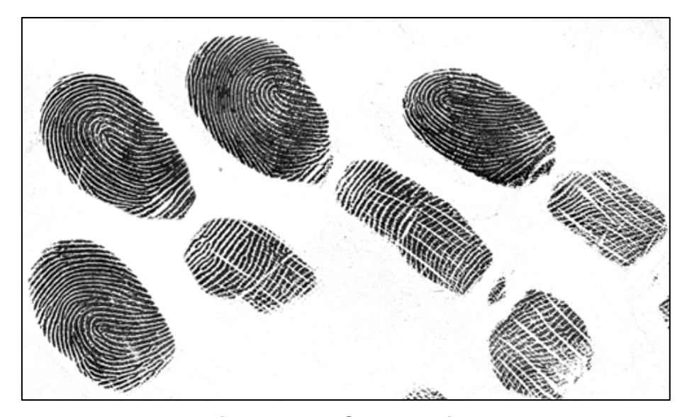
Figure 5. Slap rotation.

Image rotation poses an additional problem when a scanner with a two inch high scanning surface is used, as well as in some older paper data which has been scanned electronically. (See Figure 5.)