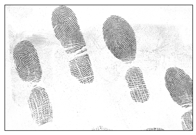
Figure 3. "Noisy" slap image.

Background noise such as extraneous print lines, printed letters, smudges, etc near the boundary of the slap print pose an additional challenge for segmentation. (See Figure 3.) "Noise", which may also be caused by dirt on the platen surface of the scanner, is most problematic in low contrast images.