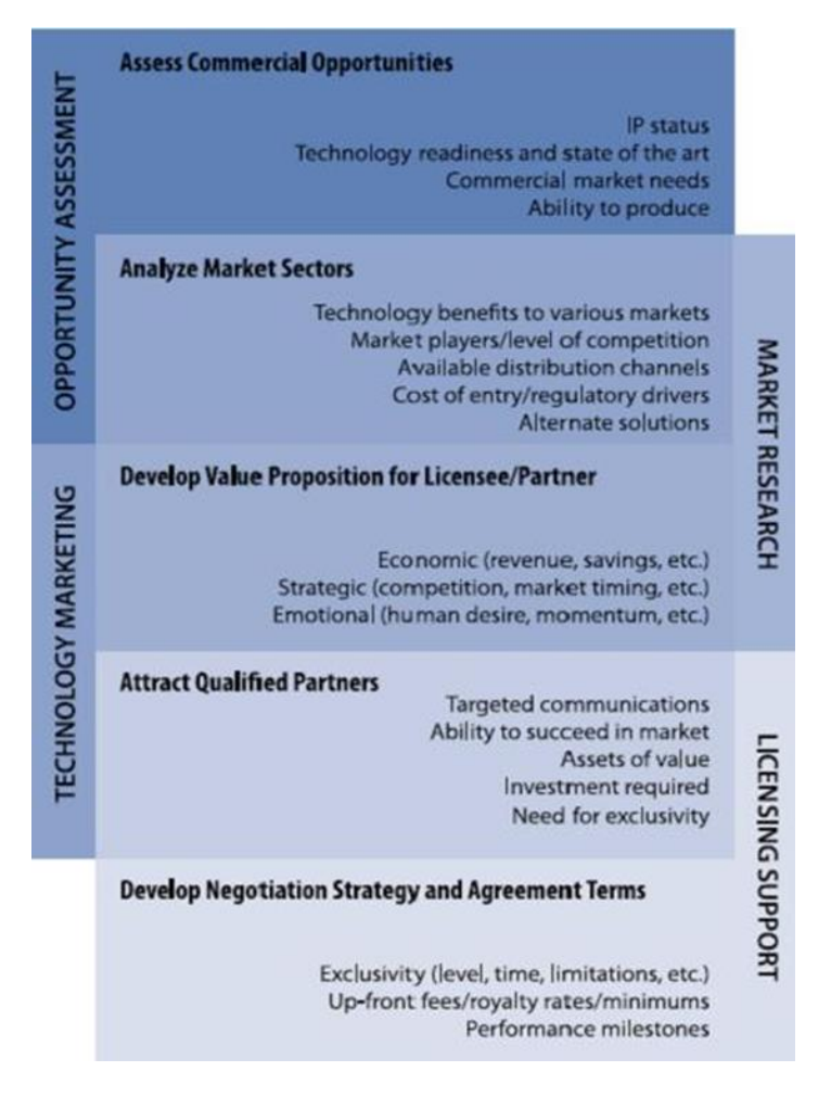
Figure 3: Possible M-TAC services in support of technology commercialization