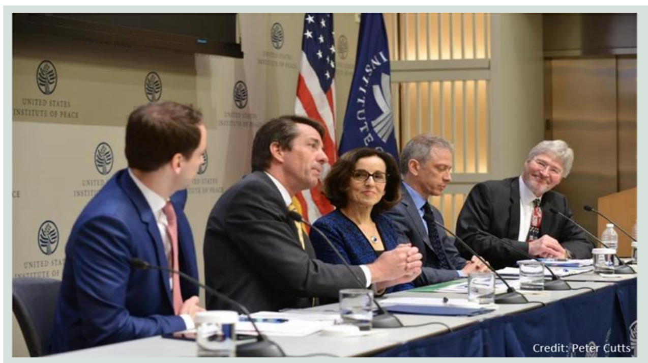
Figure 1. Federal panelists at the Unleashing American Innovation Symposium, held at U.S. Institute of Peace, Washington, D.C. on April 19, 2018.

The ROI Initiative's vision is to "unleash American innovation" into our economy and its goal is to "maximize the transfer of Federal investments in science and technology into value for America in ways that will (a) meet current and future economic and national security needs in a rapidly shifting technology marketplace and enhance U.S. competitiveness globally, and (b) attract greater private sector investment to create innovative products, processes, and services, as well as new businesses and industries."