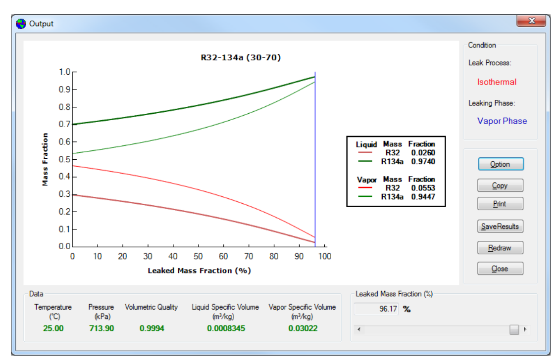
Figure A-14 Data display in a graph format (leak process)

After the simulation is complete, a graph (Figure A-14) is displayed showing composition change during the leak process versus mass percentage leaked out of the system. The vertical bar in the graph indicates the corresponding mass fraction of each of the components. Corresponding vapor and liquid compositions are displayed on the screen as numbers. The vertical bar can be moved by scrolling the slider located on the lower right. At each mass percentage ( x variable), vapor and liquid compositions including temperature, pressure, quality, liquid specific volume, and vapor specific volume are displayed.