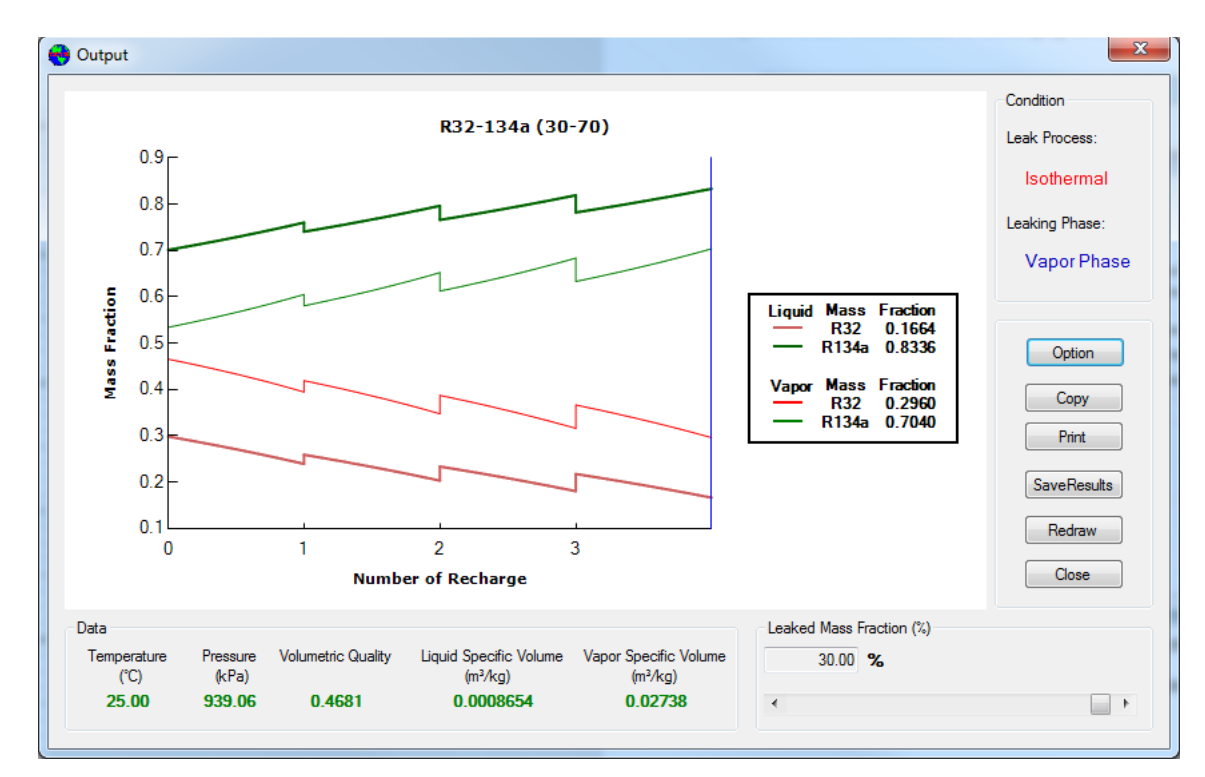
Figure B-2 Data display in graphical format (leak and recharge process)