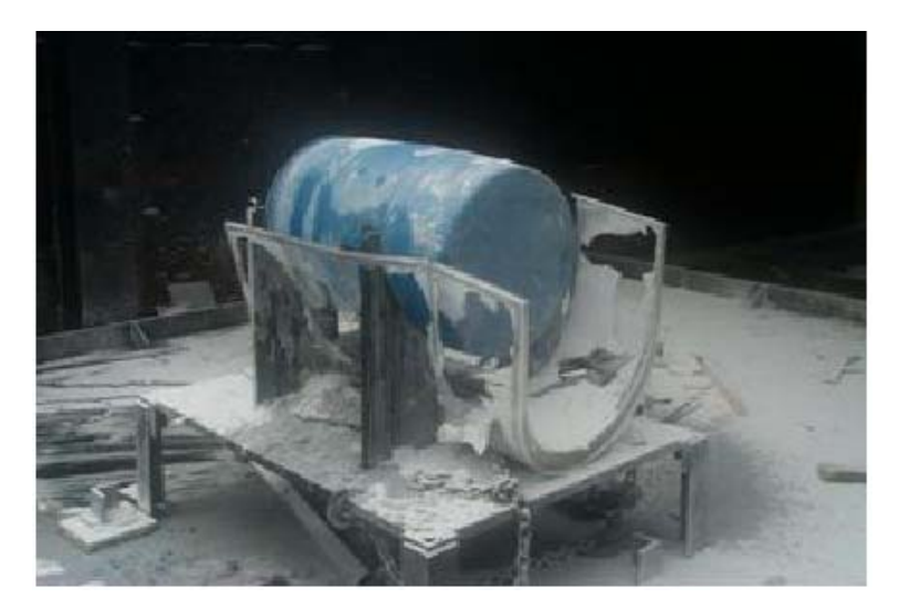
Figure 5. Post experiment photograph of 3 in. thick powder panel.