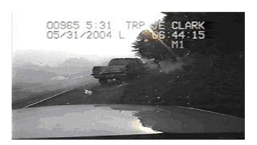
Fig. 14. Powder remains near tank after 15 seconds.