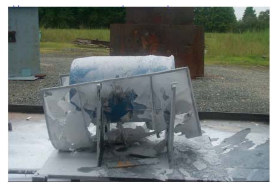
Figure 7. Post experiment photograph of 1.5 in. powder panel.

The fourth experiment evaluated a 1.5 in thick (at the base) powder panel that contained 34.15 kg (75.3 lbs) of Monnex powder. The interaction of the threat with the tank ignited a flash fire that was observed on the high speed video to be extinguished by the powder panel in 40 ms, although the infrared video indicated a fire out time of 1.758 s. It should be noted that the entire high speed video screen was washed out at 1 ms, and the fire appeared to reflash several times at 3.5 ms and 13 ms after the threat was initiated. The fire ball was primarily located on the threat side of the fuel tank and at its maximum size was approximately 236.0 cm (93 in) width and 139.7 cm (55 in) tall. The damage hole diameter caused by the threat was measured at the entrance and exit of the threat into the tank at 2.9 cm and 1.9 cm respectively, while the maximum hydrodynamic ram pressure was 17.19 psi. Figure 7 shows the powder panel breaking apart primarily along the bottom area, as well as excess powder observed on the ground. The panel break up does not appear to be as severe as the panels in experiments 2 and 3.