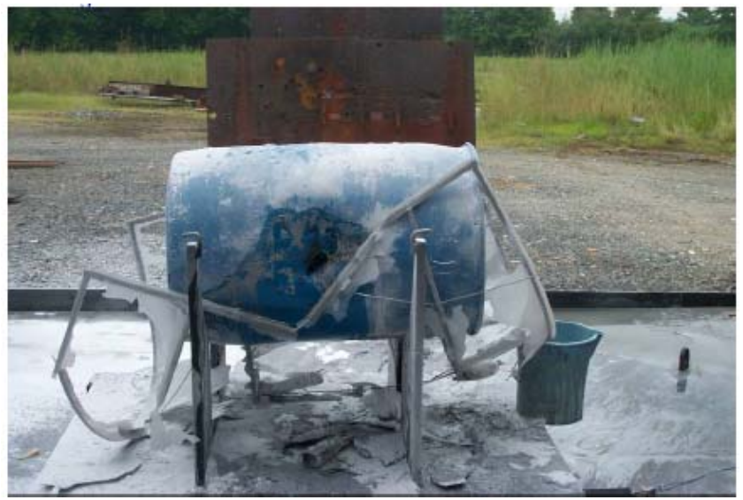
Figure 8. Post experiment photograph of 1 in. thick powder panel.