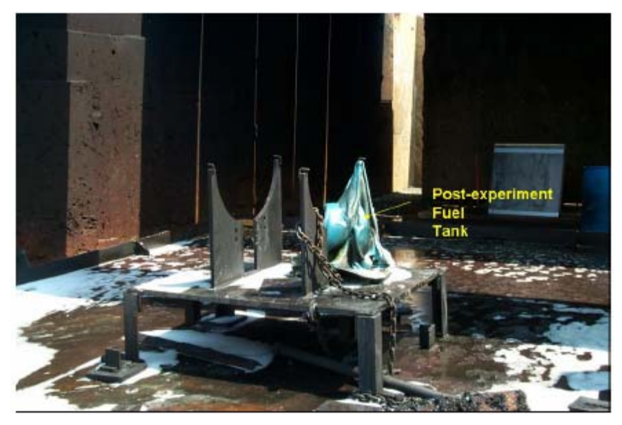
Figure 4. Post experiment photograph of unprotected fuel tank damage due to sustained fire.

With the tank becoming completely destroyed, no damage hole measurements could be obtained, however prior experiments with other tanks yielded damage holes approximately 8 cm in diameter in the entry and exit sides. Hydrodynamic ram pressures reached a maximum value of 128.6 psi.