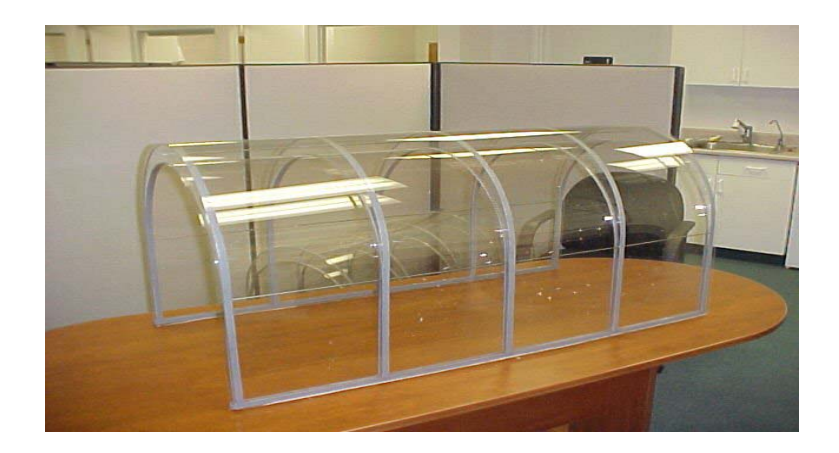
Figure 2. Prototype powder panel (empty of powder).