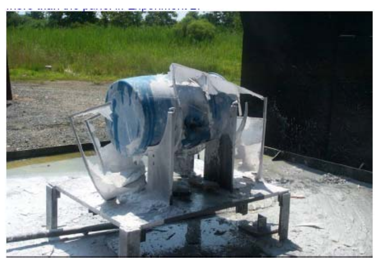
Figure 6. Post experiment photograph of 2 in. thick powder panel. Experiment 4

The third experiment evaluated a 2 in. thick powder panel that contained 40.05 kg (88.3 lbs) of Monnex powder. The interaction of the ballistic threat with the tank ignited a flash fire that was extinguished by the powder panel in 178 ms. However, the fire out time observed by the visible camera was obscured by the powder and soot from the fire suppression process. Observations from the infrared video indicated a fire out time of 1.206 s. It should be noted that the entire high speed video screen was washed out at 1 ms, and the fire appeared to reflash until it extinguished. Both the visible and infrared video showed the fire pushing away from the fuel tank over some time until extinguishment. The fire was primarily located on the entrance side of the fuel tank, and its maximum size was approximately 121.92 cm (48 in) in width and 139.7 cm (55 in) tall. The damage hole diameters caused by the threat were measured at the impact entrance and exit points of 12.76 cm and 4.39 cm respectively. Figure 6 shows that after the experiment some powder had not been dispersed from the bottom of the panel, as well as the existence of powder on the surrounding ground, which also probably did not contribute to the fire suppression.