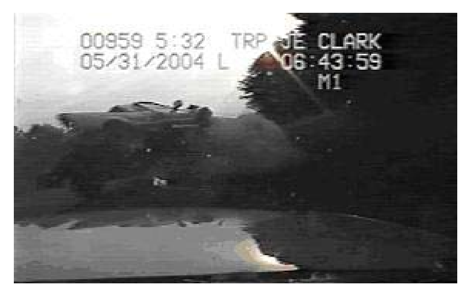
Fig. 12. Police car, truck immediately after impact.

Figure 12 shows the truck impacting the forward police vehicle at high speed, with a large plume of powder from the rear of the forward police car, emanating from the installed powder panel onboard (which are outfitted on all North Carolina State Police Crown Victoria cars).