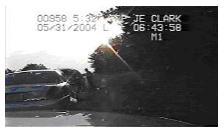
Fig. 11. Police cars on roadside before impact.

Figure 12 shows the truck impacting the forward police vehicle at high speed, with a large plume of powder from the rear of the forward police car, emanating from the installed powder panel onboard (which are outfitted on all North Carolina State Police Crown Victoria cars).