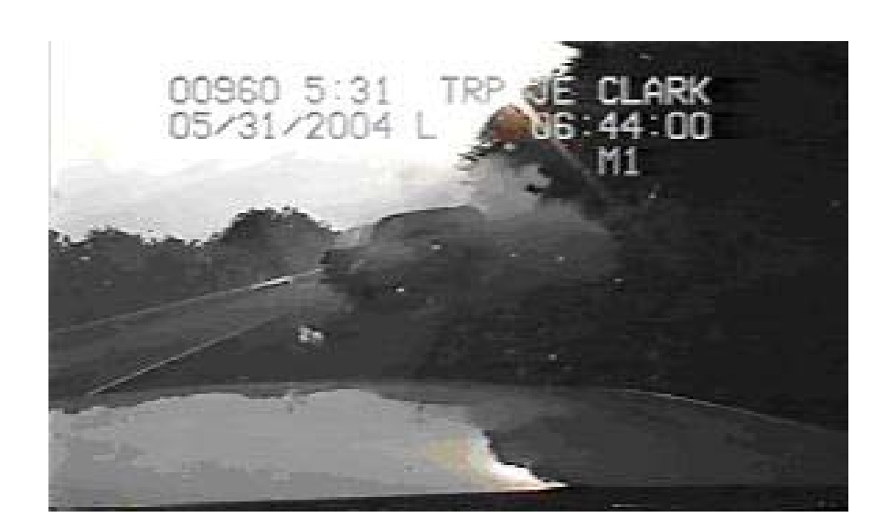
Fig. 13. Powder plume resides after vehicles stop.