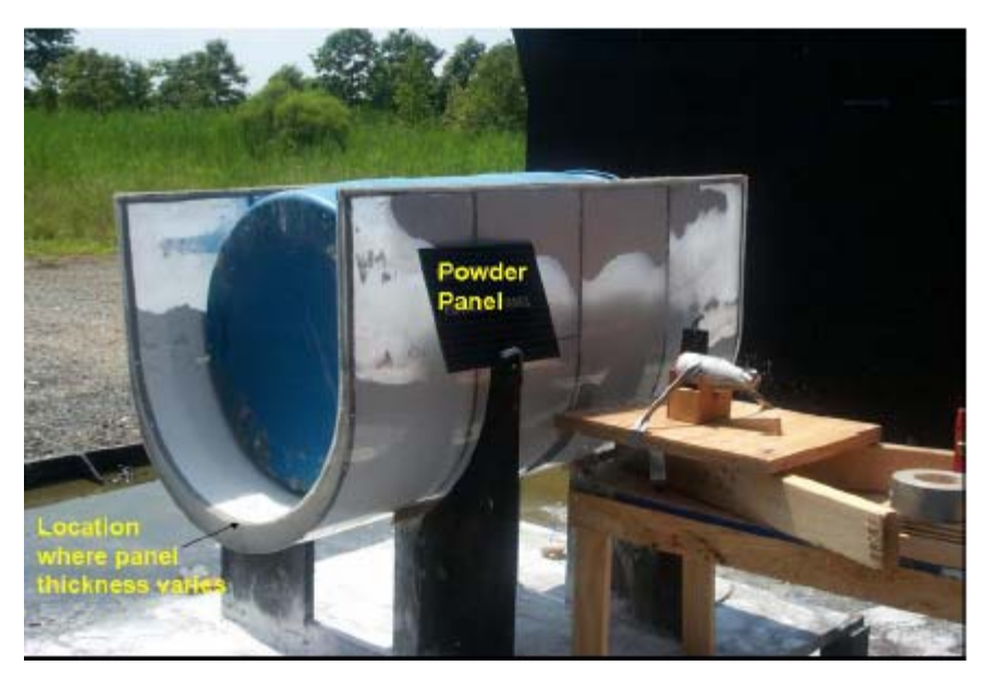
Figure 3. Filled and installed powder panel and experimental arrangement.

The powder used in the panels is a potassium bicarbonate-urea complex originally developed by ICI under the trade name MONNEX, and is intended for use in Class B and C fires.