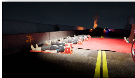
Mass Casualty Triage Scenario