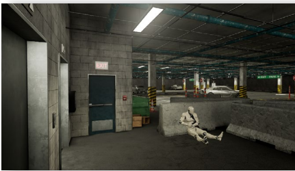
Active Shooter Scenario

PSCR's User Interface and User Experience (UI/UX) Research Portfolio team developed three public safety virtual reality (VR) environments across fire, SWAT, and emergency medical service (EMS) scenarios. These environments were created in partnership with public safety agencies who reviewed and provided feedback to PSCR, helping them improve and make the scenes as realistic as possible. Developers at PSCR have created various user interfaces in these environments with visual indicators, sounds, and voice commands for each scenario. In the future, such interfaces could be embedded in firefighters' masks or smart glasses worn by emergency medical technicians, for example to aid their emergency response. A visual display might show the temperature or audio might warn that oxygen is low in a backpack tank. The intent of these UIs, tested in the virtual environment, is to present helpful data in an intuitive and non-intrusive manner. Before these interfaces are realized, the virtual reality environments serve as a realistic, safe, and economical method for training environments, prototype testing, and data collection and measurement, both for researchers and public safety agencies alike.