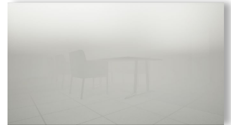
Commercial Building Fire Scenario