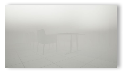
Commercial Building Fire Scenario