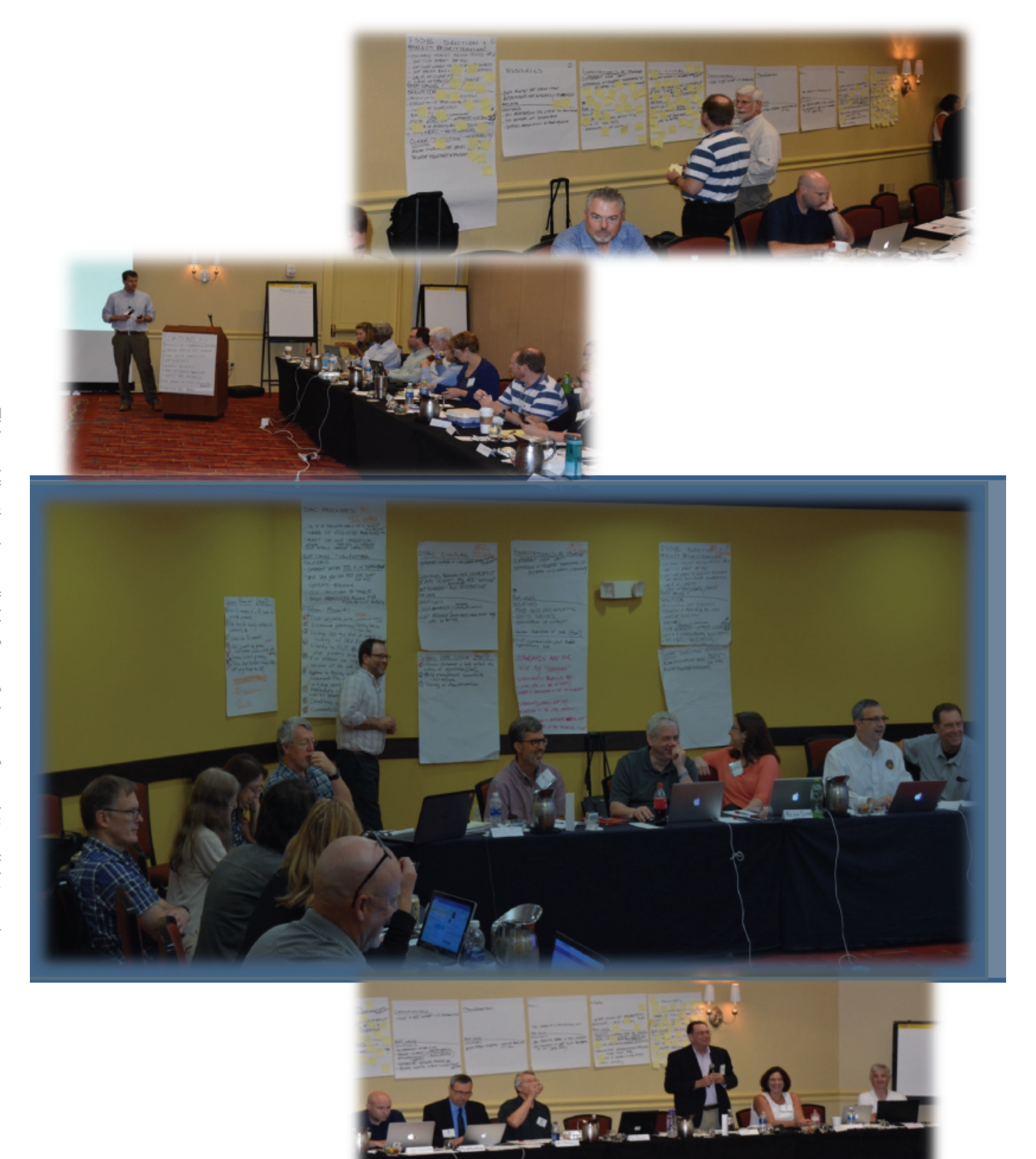
Fig. 6, 7, 8, 9. Members of the FSSB, SACs, and subcommittees at the OLSS Meeting in September 2017.