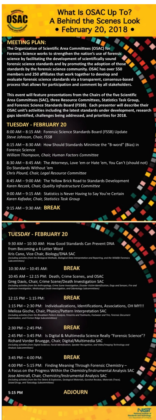
Fig. 11. Public meeting agenda.