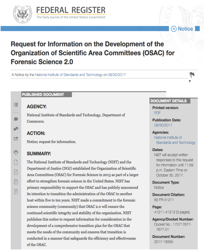
Fig. 12. Federal Register Announcement

These concepts were offered to generate ideas and input and were not meant to be exhaustive. NIST is open to maintaining elements of the current OSAC structure, modifying the structure, and considering substantially different structures, including ideas received from the public comments concerning the six areas proposed.