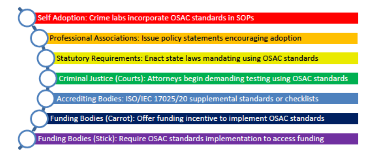
Fig. 4. Examples of OSAC Implementation Pathways Under Consideration by the FSSB.