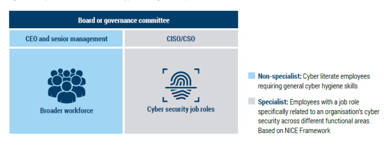
Figure 1. Cyber skills needed in a typical, larger workplace<sup>i</sup>

Australia's cyber security industry growth centre, known as AustCyber, has been providing national level advocacy across Australian governments, industry and academia for the adoption of the United States (US) National Institute of Standards and Technology (NIST) Publication 800-181 National Initiative for Cybersecurity Education (NICE) Cybersecurity Workforce Framework (the NICE Framework) as the best publicly available resource to describe the diversity of cyber security work roles as well as the knowledge, skills, abilities and tasks that underpins each role.