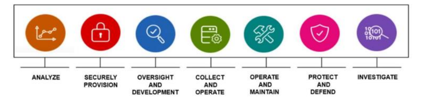
Figure 3. NICE Framework Categoriesiv

The organising categories for the NICE Framework are appropriately broad to encompass the depth and breadth of cyber security work roles, both current and emerging. It is the view of AustCyber and our partners that these categories do not require any alterations at this time and should remain static.