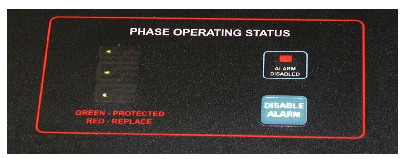
Figure 1 – Typical two color LED display (all green here) and audible alarm disable with visual indication of audible alarm being disabled

As mentioned above, there is a wide range of monitor functions and hardware offered by manufacturers. Figure 1 is an example of a local visual display with functions limited to a "keep it simple" philosophy. Figure 2 shows for a remote Form C set of contacts, and Figure 3 shows the complexity of hardware (and implied firmware and software) associated with a remote-reading function.