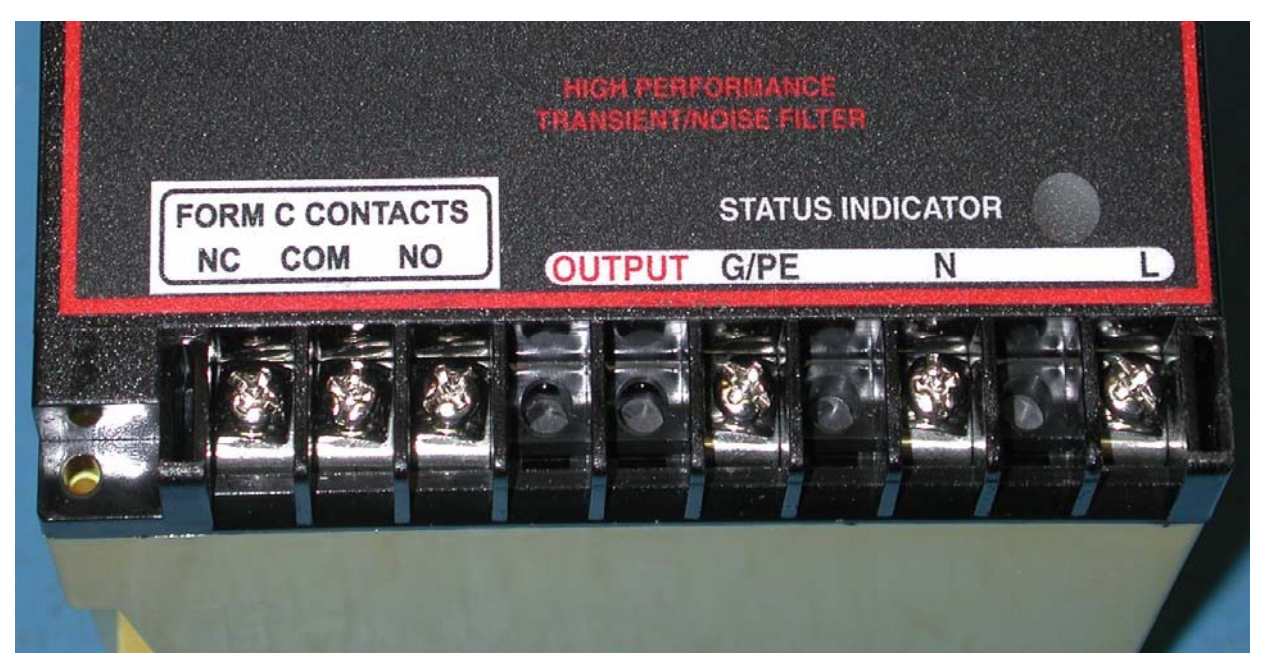
Figure 2 – SPD with Form C relay contacts terminals shown and output