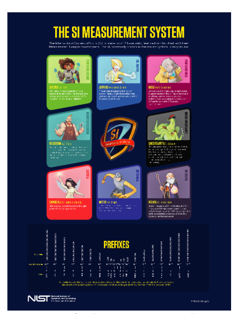
Figure 1. The SI Measurement System poster.