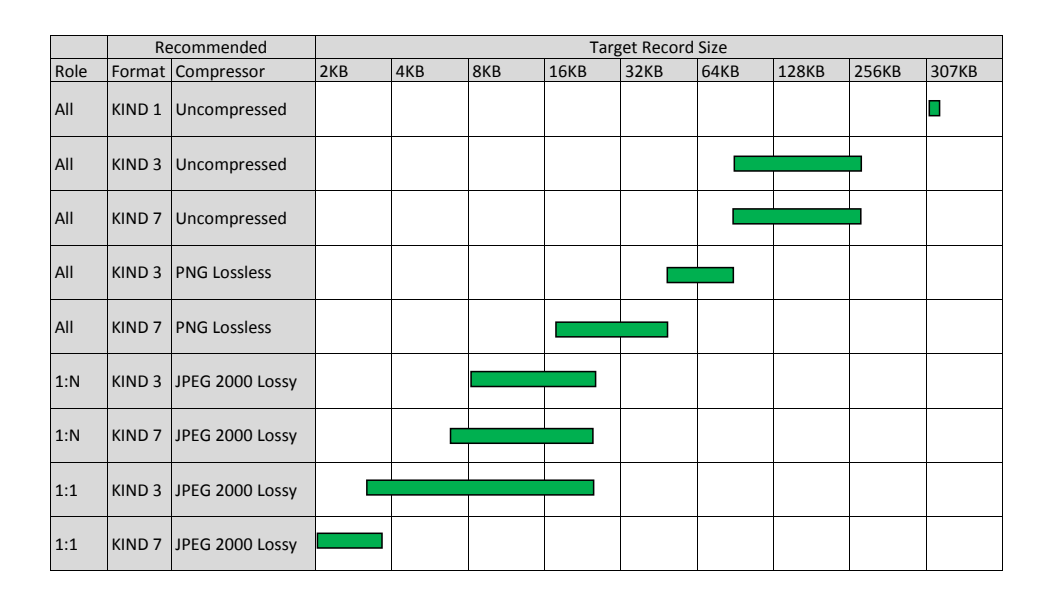
Figure 1: Application-specific recommendations on compression and format. The horizontal axis shows target file size in kilobytes on a logarithmic scale.