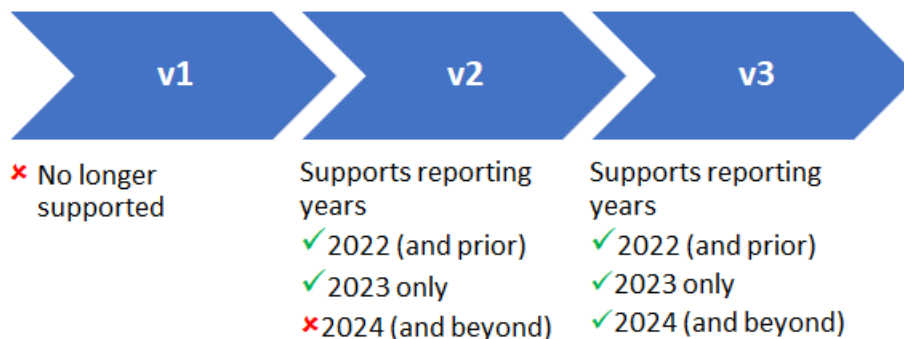
Figure 9-1: Utilization API Versions

The Utilization API allows an organization/agency to create, update, and search for an existing utilization record. The information required to submit a request will depend on the reporting year and the latest stage of development specified. The graphic below shows what reporting years each version supports.