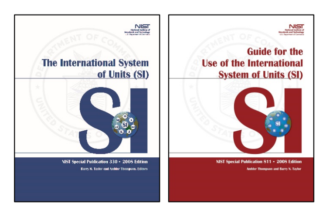
Figure 1. NIST SP 330 and SP 811 – Key technical SI resources.

NIST Special Publication (SP) 811, Guide for the Use of the International System of Units (SI) , provides<sup>11</sup> detailed rules for SI writing style, including a useful Editorial Checklist at the beginning of the document.