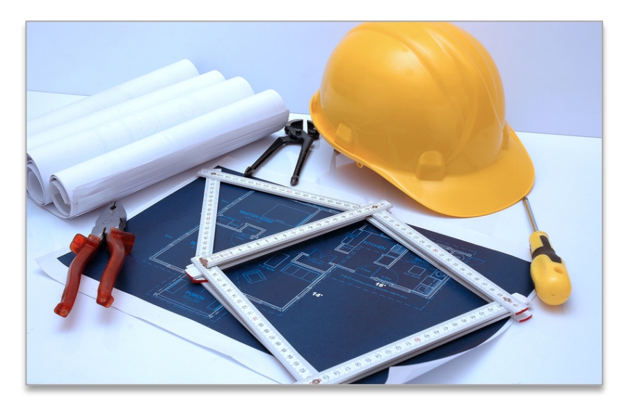
Framework 3.0 provides a blueprint for smart grid interoperability.

Just as the construction of a fully functioning modern home requires a detailed blueprint and a carefully coordinated construction plan, the development of the smart grid requires a framework and a roadmap for interoperability. A framework provides a common vision and vocabulary, a set of shared principles and practices, and a collective agreement on standards and protocols. A roadmap lays out the process—including steps, timetable, participants, priorities, intermediate goals, and more—required to make that vision a reality.