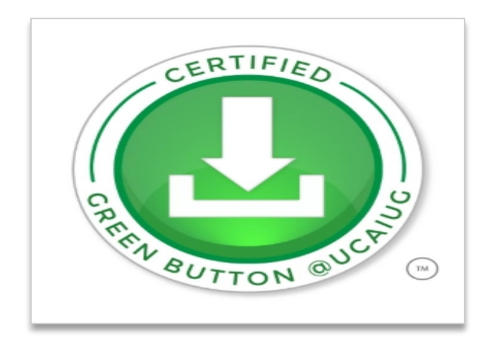
The "Green Button" standard provides a secure way to get your energy usage information electronically.

Chapter 8, "Cross-Cutting and Future Issues," contains a high-level overview of three areas of interest to the smart grid community: