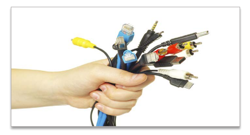
"Interoperability" allows systems and their components to work together in a "plug-and-play" approach.

Just as the construction of a fully functioning modern home requires a detailed blueprint and a carefully coordinated construction plan, the development of the smart grid requires a framework and a roadmap for interoperability. A framework provides a common vision and vocabulary, a set of shared principles and practices, and a collective agreement on standards and protocols. A roadmap lays out the process—including steps, timetable, participants, priorities, intermediate goals, and more—required to make that vision a reality.