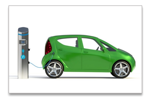
NIST has identified several standards important for interoperability of electric vehicle charging.

This chapter also discusses the process for identifying future smart grid standards. In all, hundreds of standards will likely be required to build a safe and secure smart grid that is interoperable, end to end. Therefore, the list of identified standards will continue to grow as the smart grid is developed, new needs and priorities are identified, and new technologies emerge.