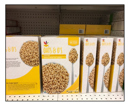
Figure 4. Properly labeled cereal packages displayed on a shelf with several PDPs not visible.

BOTH METHODS OF DISPLAYING PACKAGES ARE PERMISSIBLE