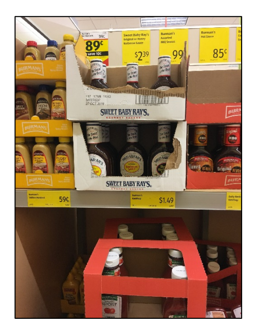
Figure 1. Packages displayed in shipping cartons where the full PDP (identity and net content) is not visible.

While OWM recommends that retailers display the PDP of packages so that the product identity and net contents are always visible, the UPLR does not include requirements about the display of packages on store shelves. The UPLR only prescribes the requirements on how packages are to be labeled by manufacturers and packers.