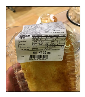
Figure 8. An iced cake with a wraparound label showing the PDP on top of the package with identity, price, and net weight and the UPC on the package bottom for scanning. Inspectors can recommend that retailers found placing the PDP label on the bottom or back of packages consider using the wraparound label as a suitable alternative.

In summary, the UPLR does not apply to the display of packages in retail stores but does apply to labeling violations in cases where it is determined that the PDP is not on the panel "most likely" to be displayed.