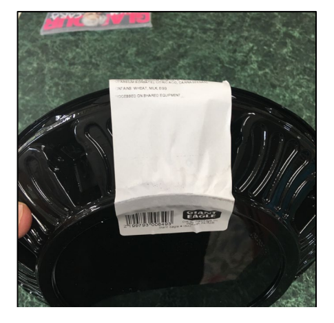
Figure 7. The picture above shows a "fragile" product (i.e., those products that would become damaged if turned over). In this example, the retailer places a "wraparound label on the product that places the identity, net weights, and price information on the top of the package for easy access and "wraps the label onto the bottom where the UPC barcode is accessible without turning the package over when scanned.