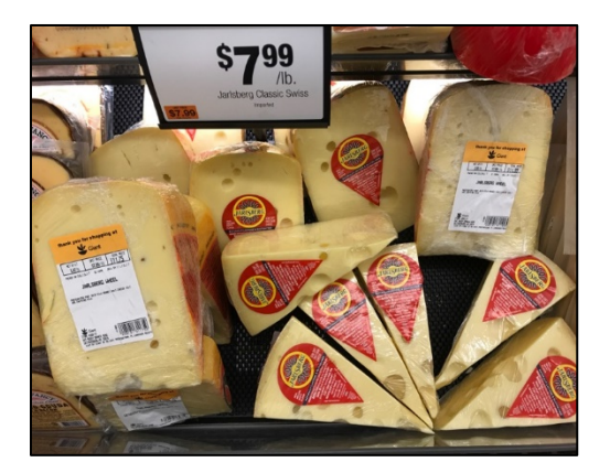
Figure 3. Properly labeled packages displayed in a case with several PDPs not visible.

There are other situations as well, where the PDP of packages are often not visible when they are displayed. For example, properly labeled packages of cheese or turkeys are often placed in display coolers, shelves, or bins where a consumer cannot view the PDP, which is often a random weight label bearing the product identity, net weight, total price and unit price of the product (See Figure 3). Since consumers habitually pick up packages to read the label, it is not uncommon for them to return the products to the wrong location on the shelf or to place the package back on the shelf with the PDP hidden. This is the reason that the UPLR regulations do not consider a package that is displayed with the PDP out of view to be a violation (see also Figure 4).