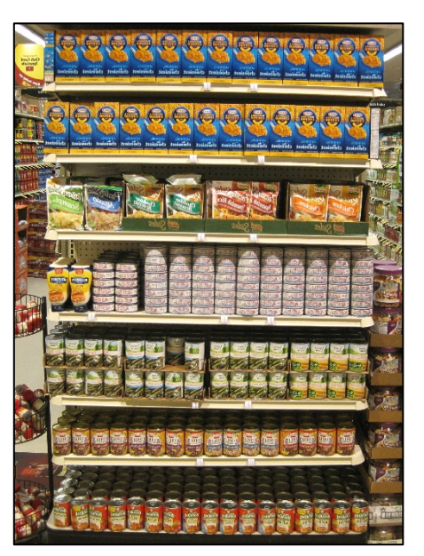
Figure 2. Packages displayed with the PDP visible to consumers without the need for them to handle the package.

BOTH METHODS OF DISPLAYING PACKAGES ARE PERMISSIBLE