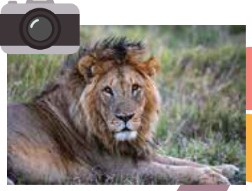
Original image from camera.

Digital media editing is the process of working with technology to modify an image, video, or audio. Deepfakes or repurposed media can be edited too.