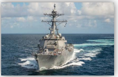
DDG 51 Surface Combatants