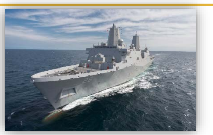
LPD 17 Amphibious Transport Docks