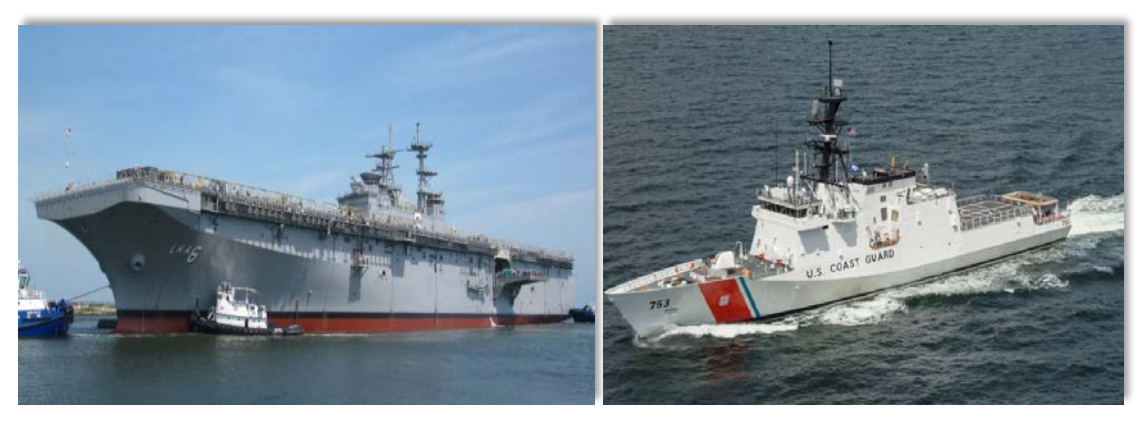
LHA 6 America Amphibious Assault Ship