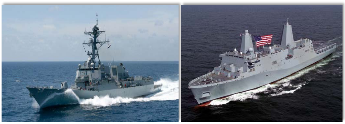
DDG 51 Class Aegis Destroyer Surface Combatant