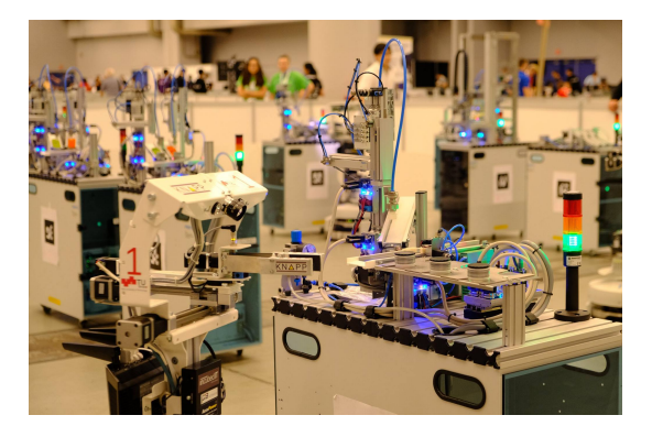
Fig. 1. Physical setup of the RoboCup Logistics League.

The RCLL [2], [3] is part of the RoboCup initiative and focuses on the stimulation of the development of approaches in Robotics and Artificial Intelligence using robotics competition. In this league the goal is that a team of robots in cooperation with a set of production machines produces products on demand. Two teams share a common factory floor of the size of 14m x 8m. Each team comprises of up to 3 autonomous robots and owns 7 machines. See Figure 1. There are different types of machines that resembles different production steps like fetching raw material, assembling parts, or delivering final products. The task of the teams is to develop methods that coordinate the robots (which can drive around) and machines (which are static). Robots and machine are allowed to communicate via WiFi. Robots are cooperative in the sense that they needs to interact physically with the machines, e.g. fetching raw material from a dispenser machine or provide intermediate products to machine that