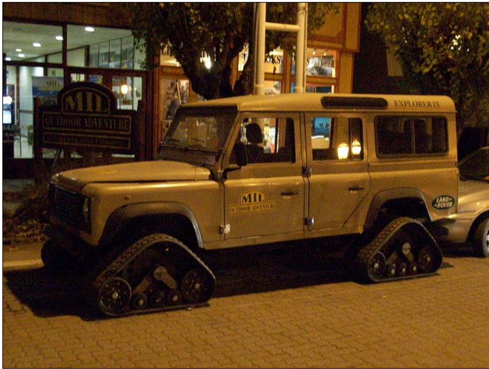
(Patagonia 4x4 Off Road Expeditions by Mil Outdoor Adventure, El Calafate, Provincia de Santa Cruz, Patagonia Argentina.)