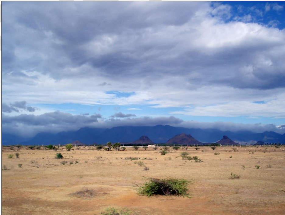
(A desert: The rainshadow region of Tirunelveli, India. By Arun Ganesh.)