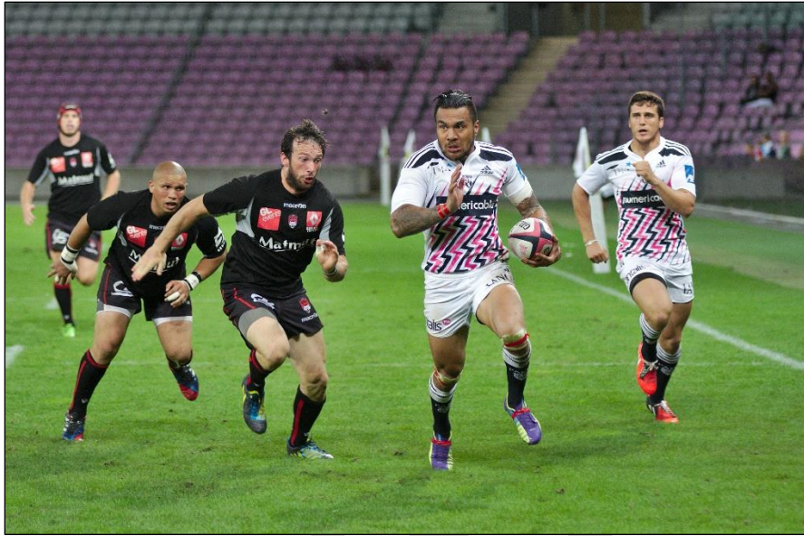
(Geneva Rugby Cup - 20140808 - SF vs LOU. By Clement Bucco-Lechat.)

(The four photographs below were acquired from the Wikimedia Commons and are attributed to their authors.)