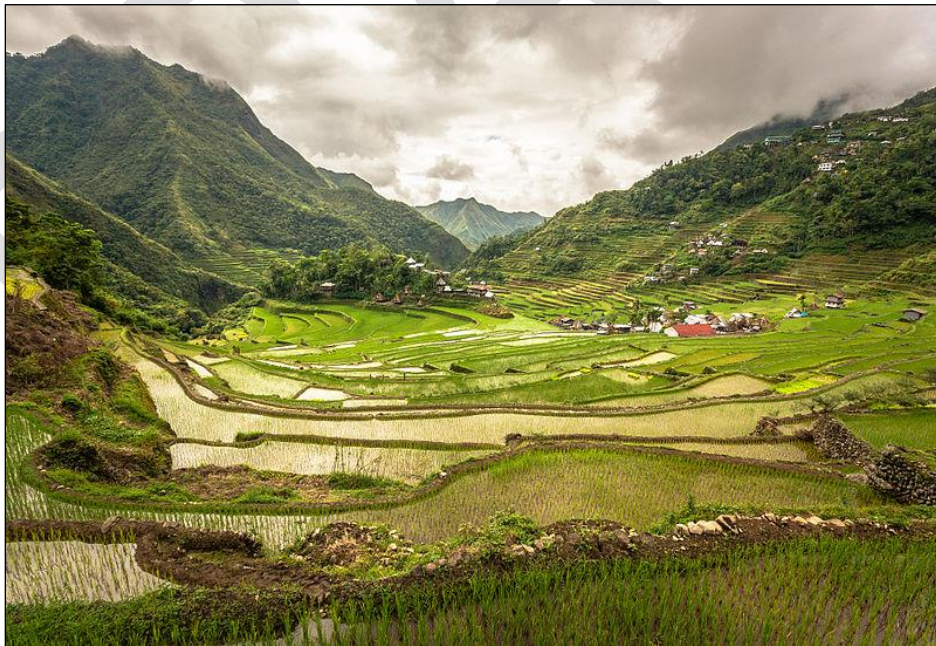
(Philippine rice terraces, Batad village. By Adi.simionov .)