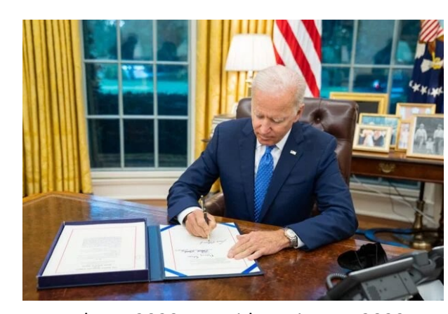
March 11, 2022 - President signs FY2022 omnibus spending bill.