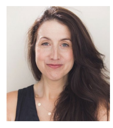
Founder and General Counsel, SafePorter